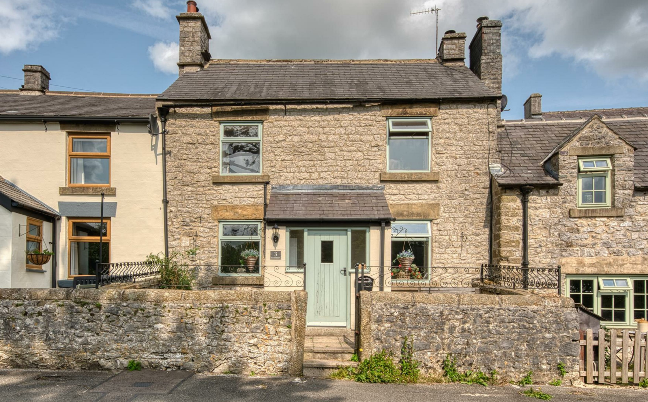
The Bobbin, 3 Lower Terrace Road, Tideswell, Derbyshire, SK17 8LX