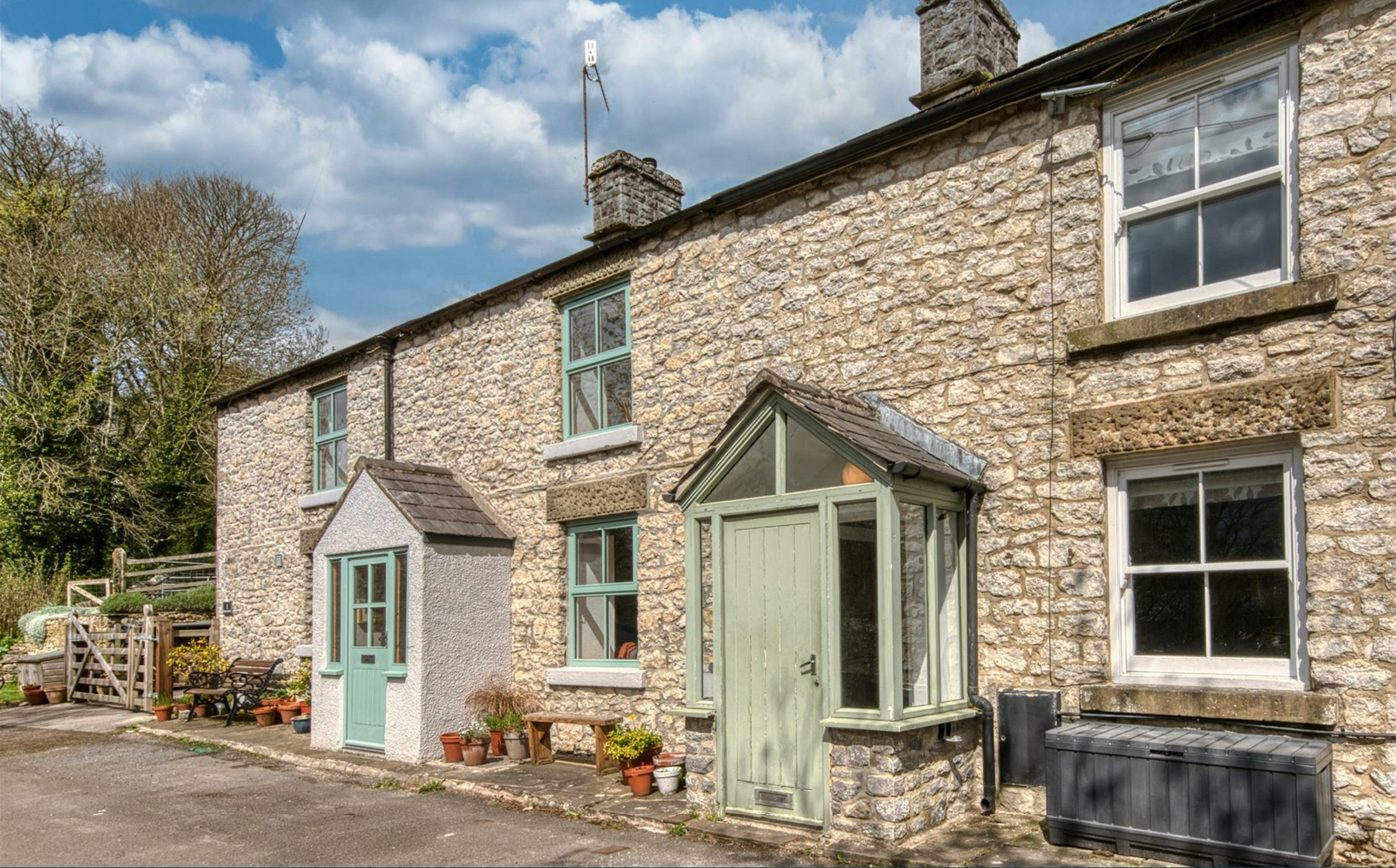
2 The Lodge, Tideswell, Derbyshire, SK17 8PH