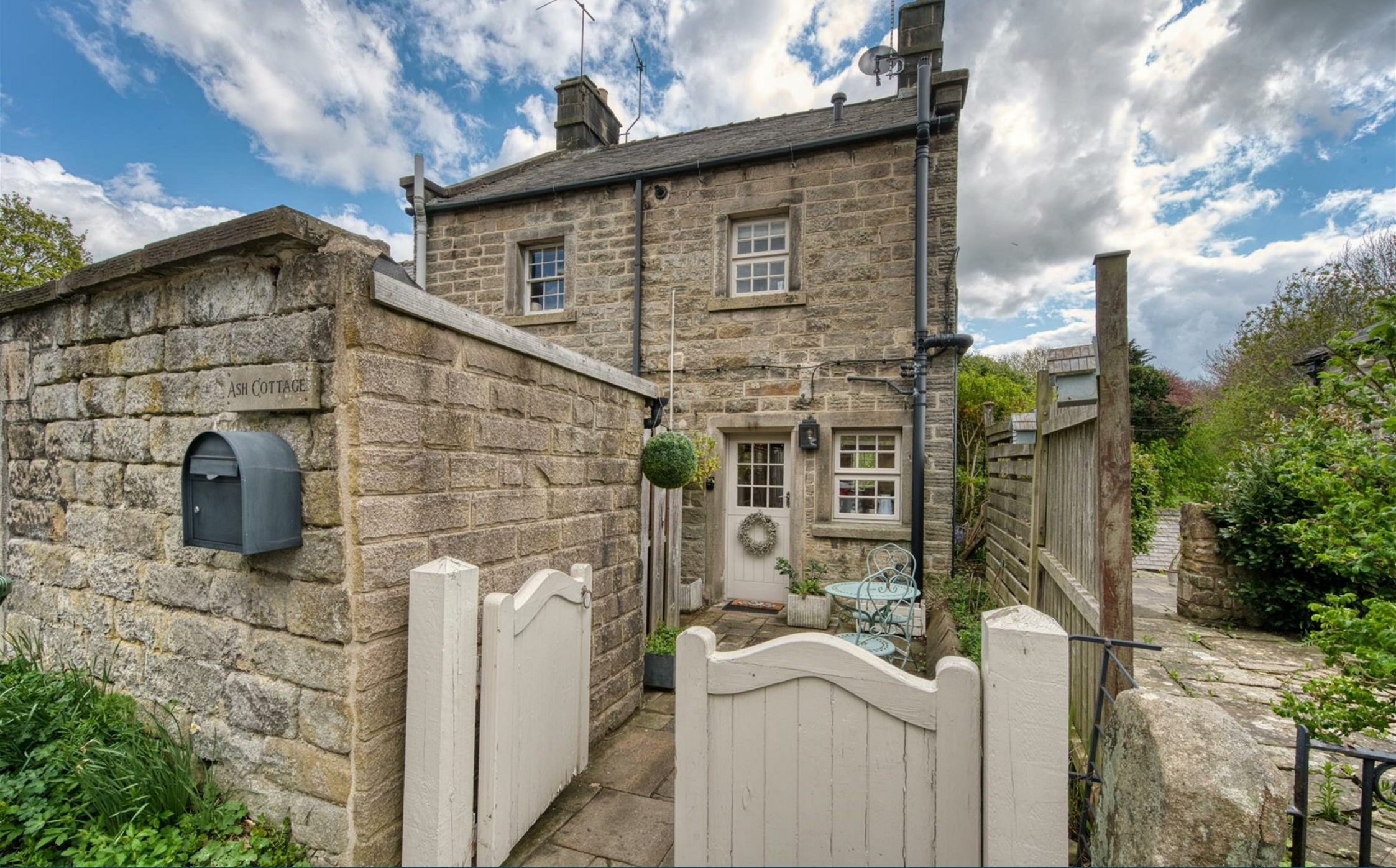
Ash Cottage, School Lane, Baslow, Derbyshire, DE45 1RZ