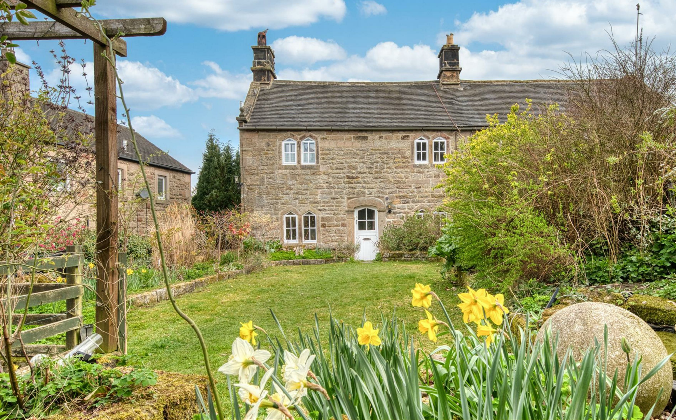
Church Cottage, Main Road, Stanton-In-Peak, Derbyshire, DE4 2LX