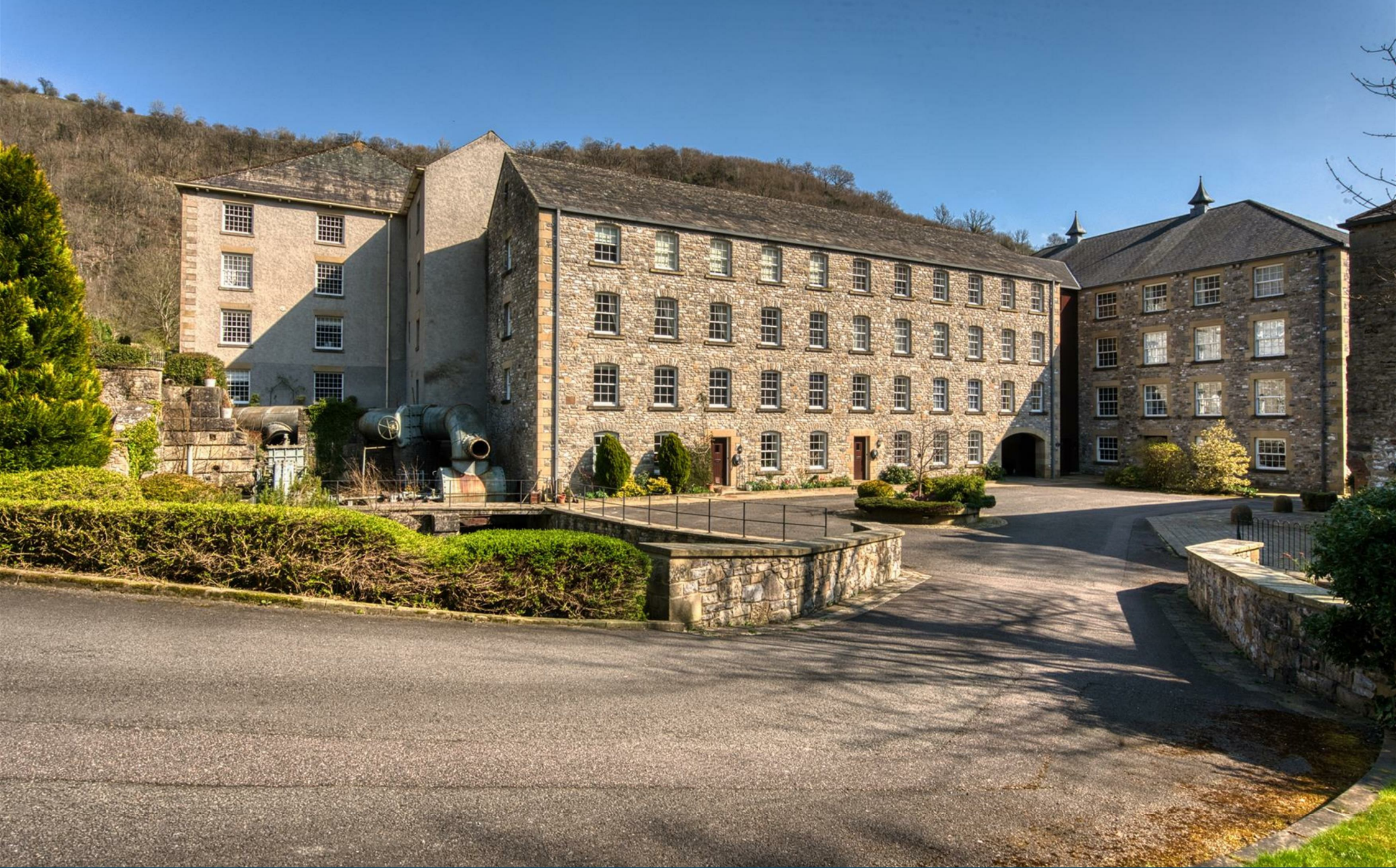
19 Arkwright Mill, Cressbrook, Derbyshire, SK17 8SA