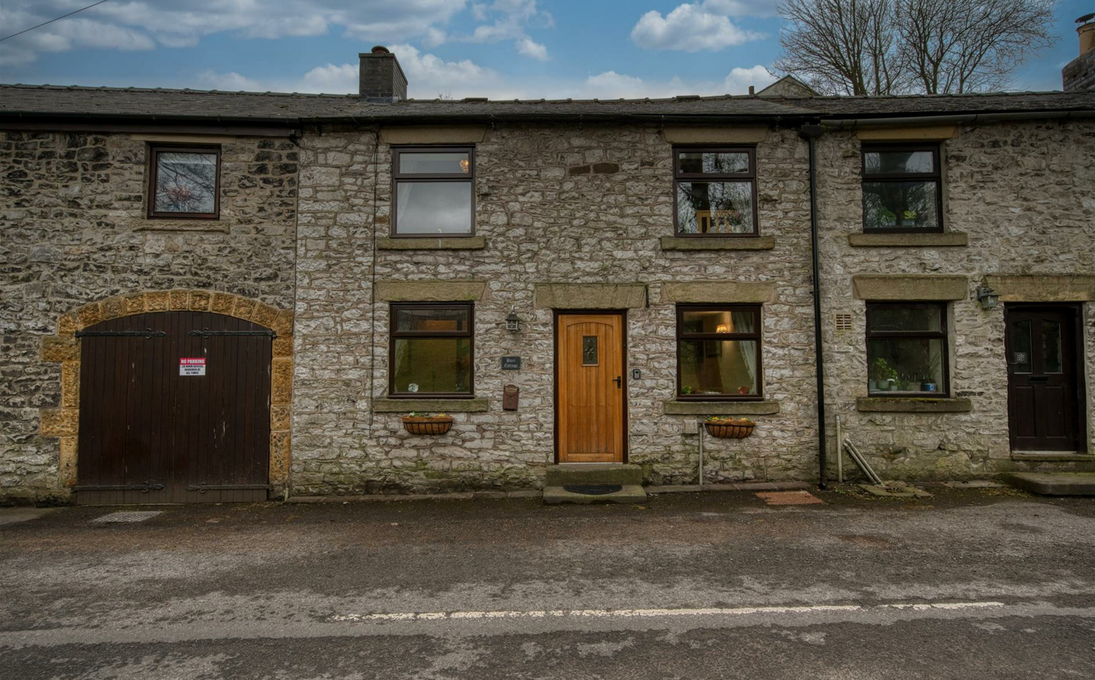
Barr Cottage, Manchester Road, Tideswell, Derbyshire, SK17 8LL