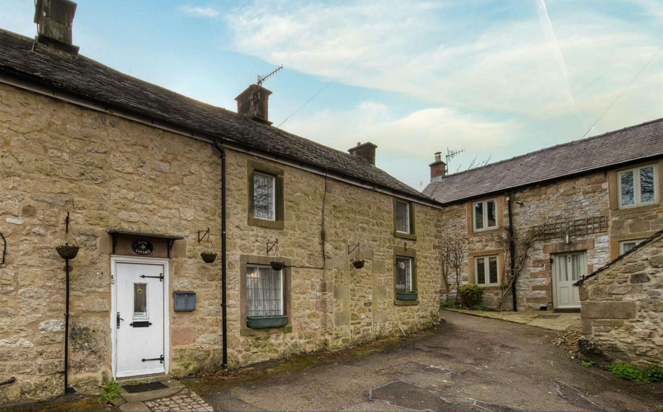
Bank Cottage, East Bank, Winster, Derbyshire, DE4 2DT