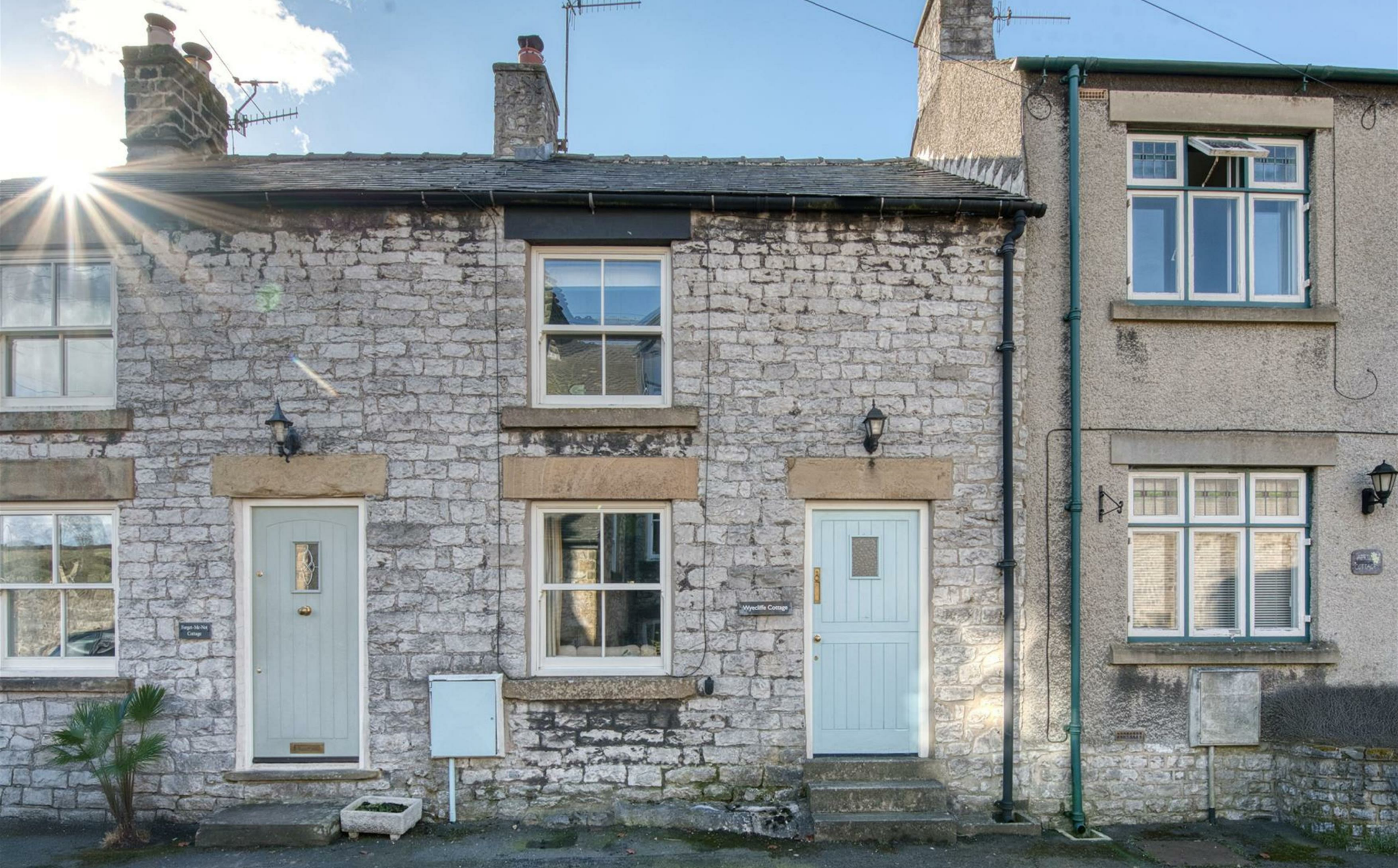
Wycliffe Cottage, Gordon Road, Tideswell, Derbyshire, SK17 8PT