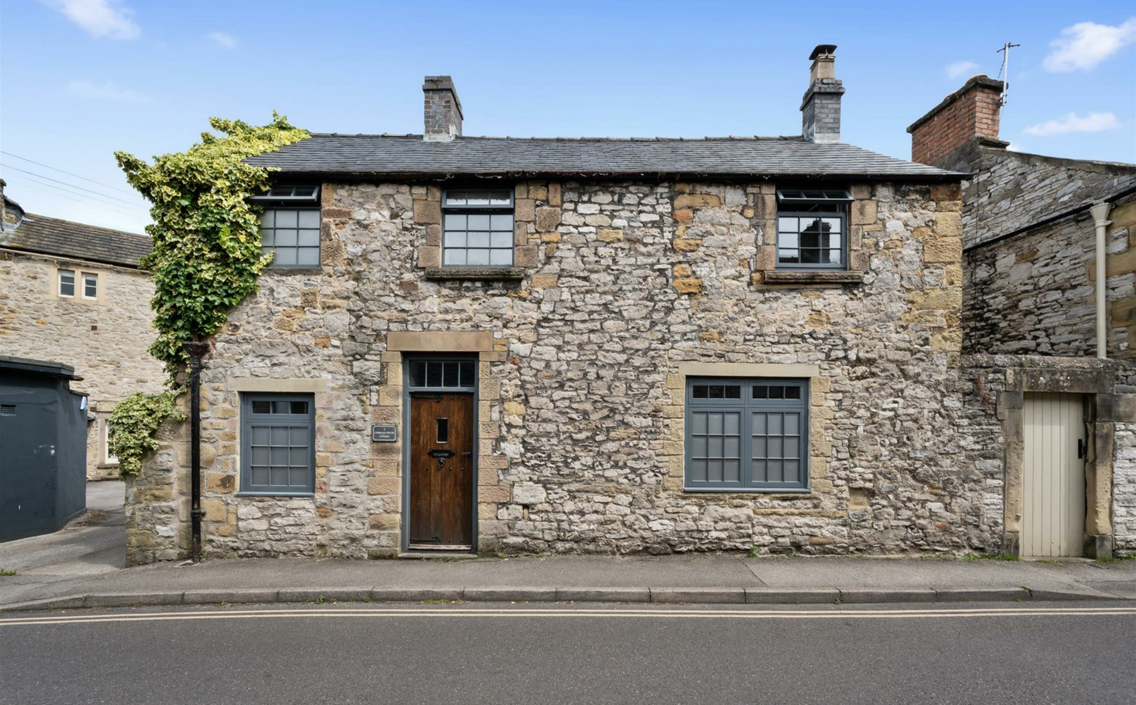
Carriage House, Butts Road, Bakewell, Derbyshire, DE45 1EB