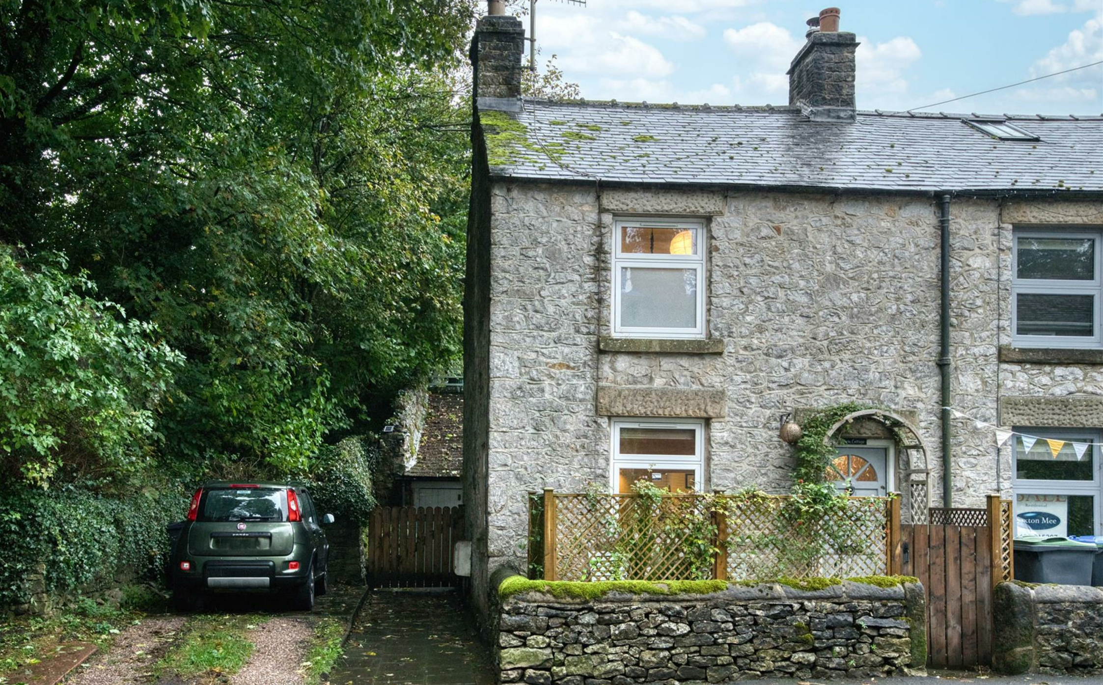
Marli Cottage, Buxton Road, Tideswell, Derbyshire, SK17 8PQ