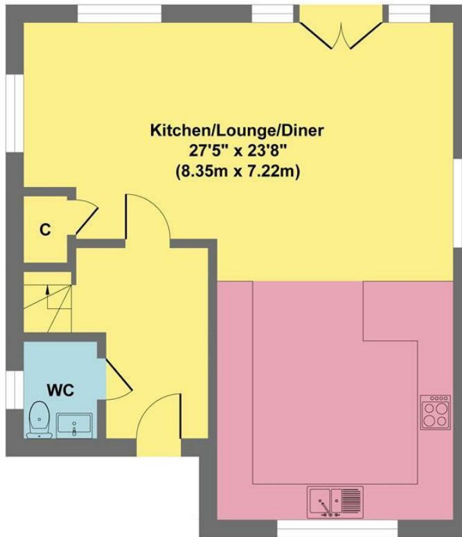
Ground Floor Approximate Floor Area 601 sq.ft (55.84 sq.m.)