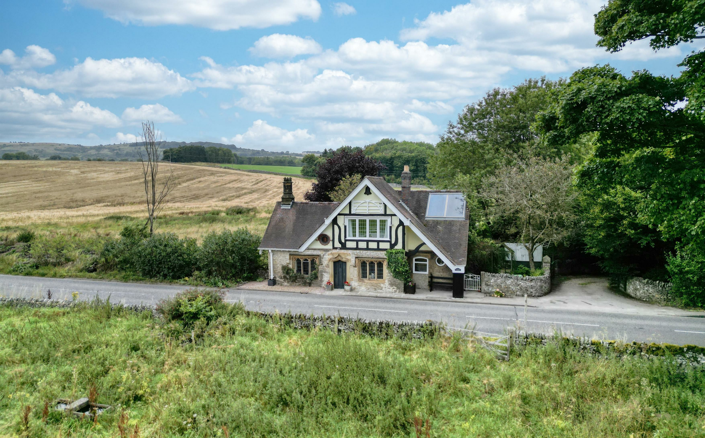
Toll Bar House, Hassop, Derbyshire, DE45 1NW