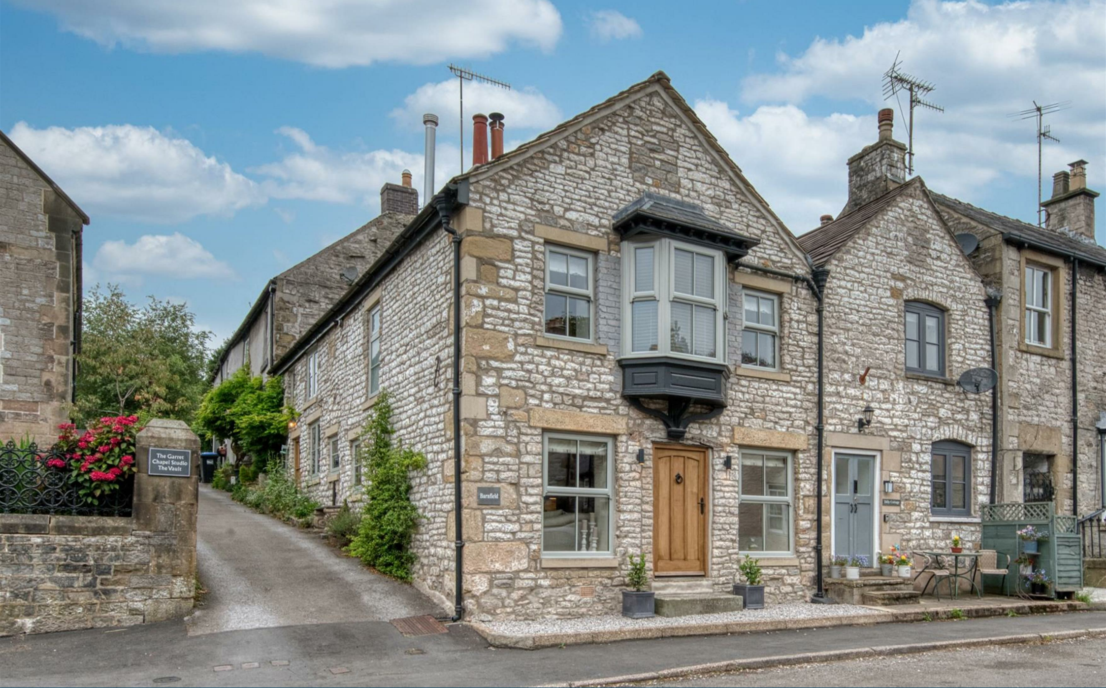
Barnfield, High Street, Tideswell, Derbyshire, SK17 8LB