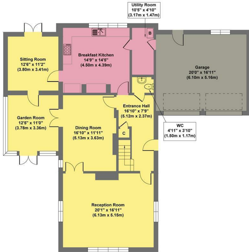
Ground Floor Approximate Floor Area 1631 sq.ft (151.56 sq.m.)