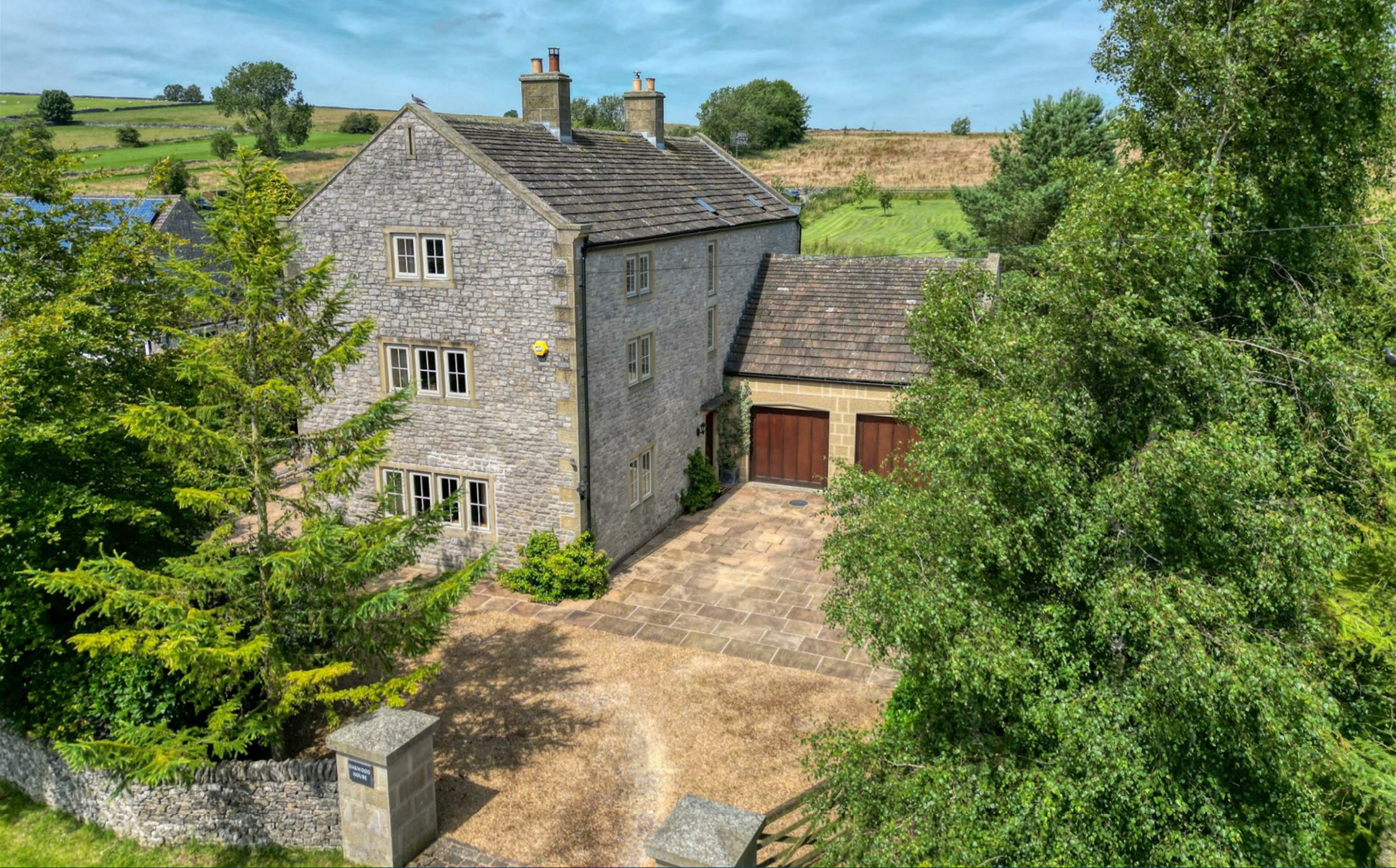
Oakwood House, Monyash Road, Over Haddon, Derbyshire, DE45 1HZ