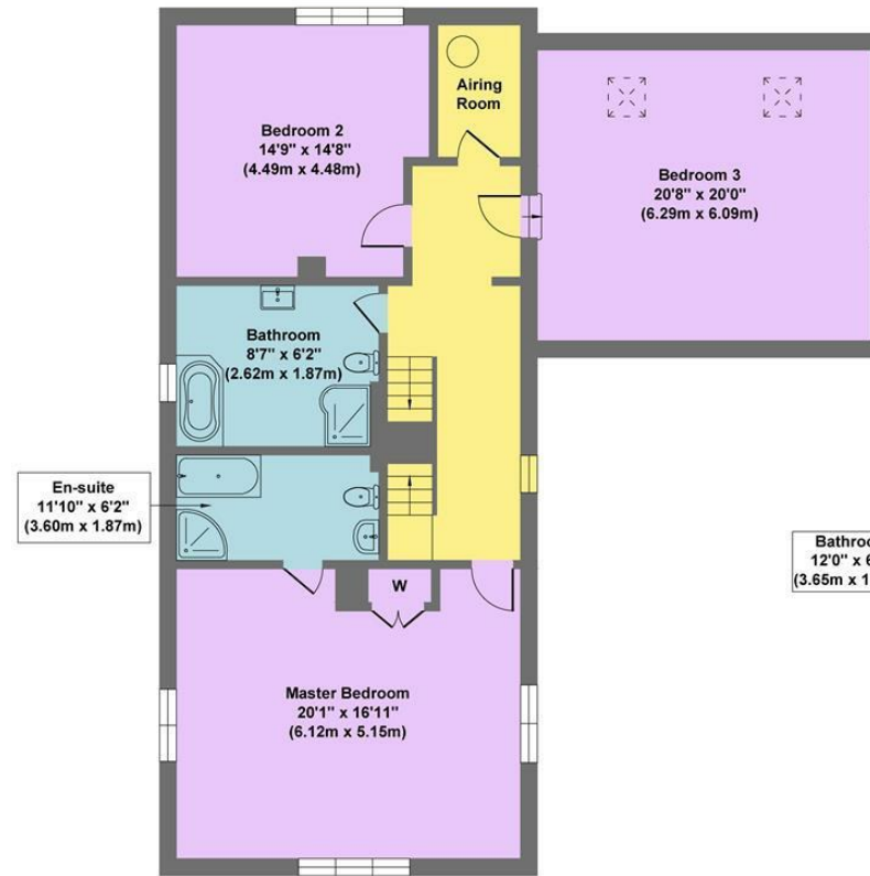
First Floor Approximate Floor Area 1323 sq.ft (122.88 sq.m.)