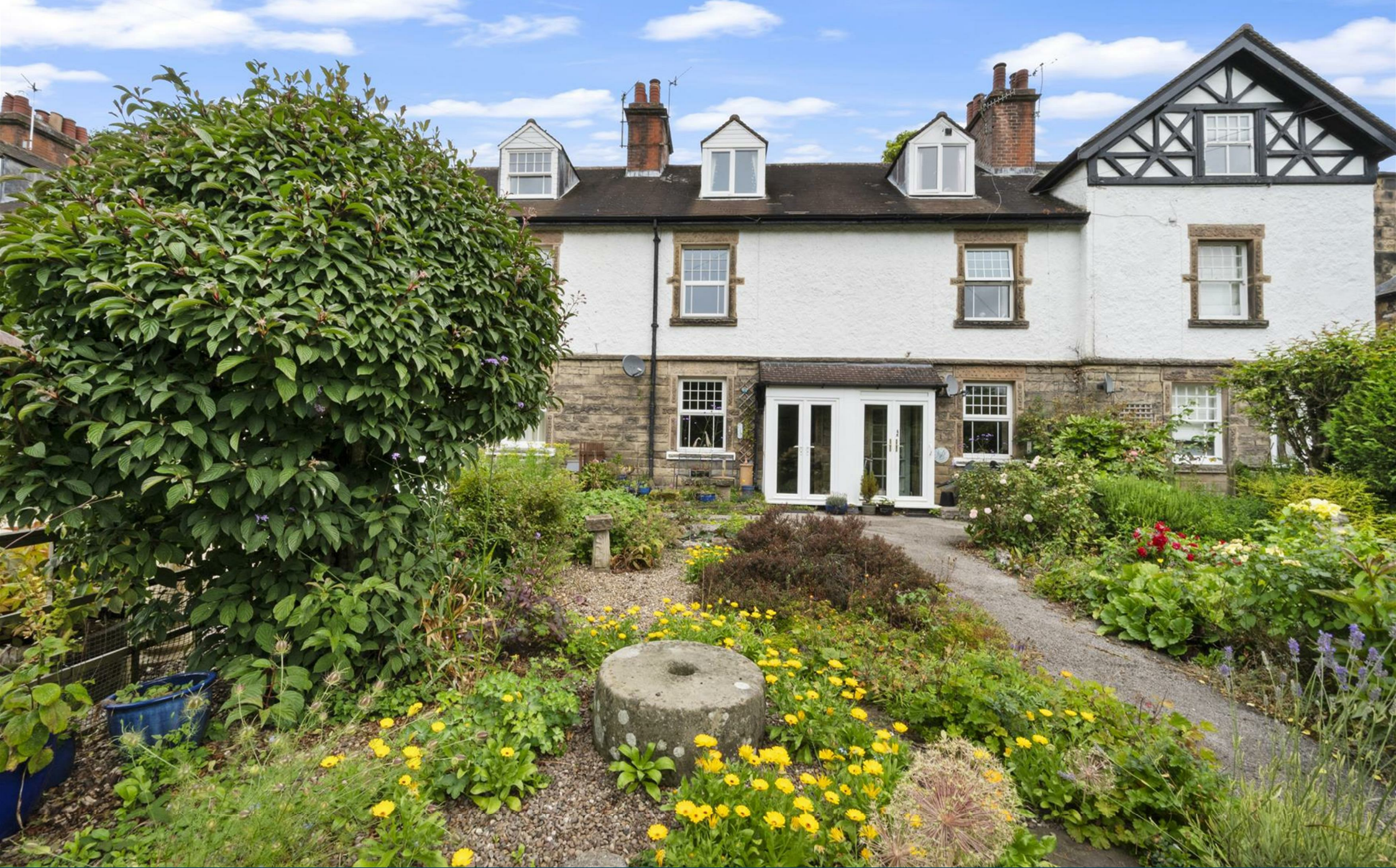
3 Old Lumford Cottages, Bakewell, Derbyshire, DE45 1GG