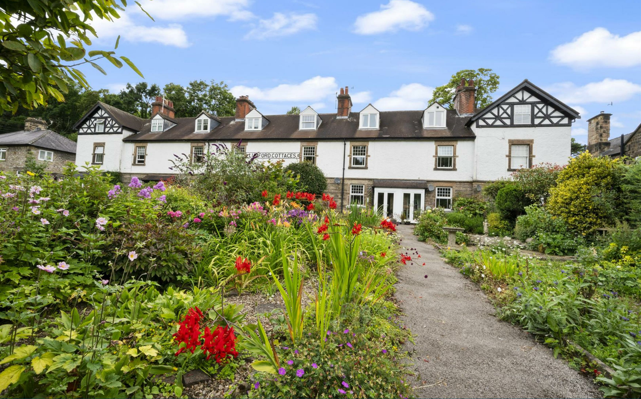
3 Old Lumford Cottages, Bakewell, Derbyshire, DE45 1GG