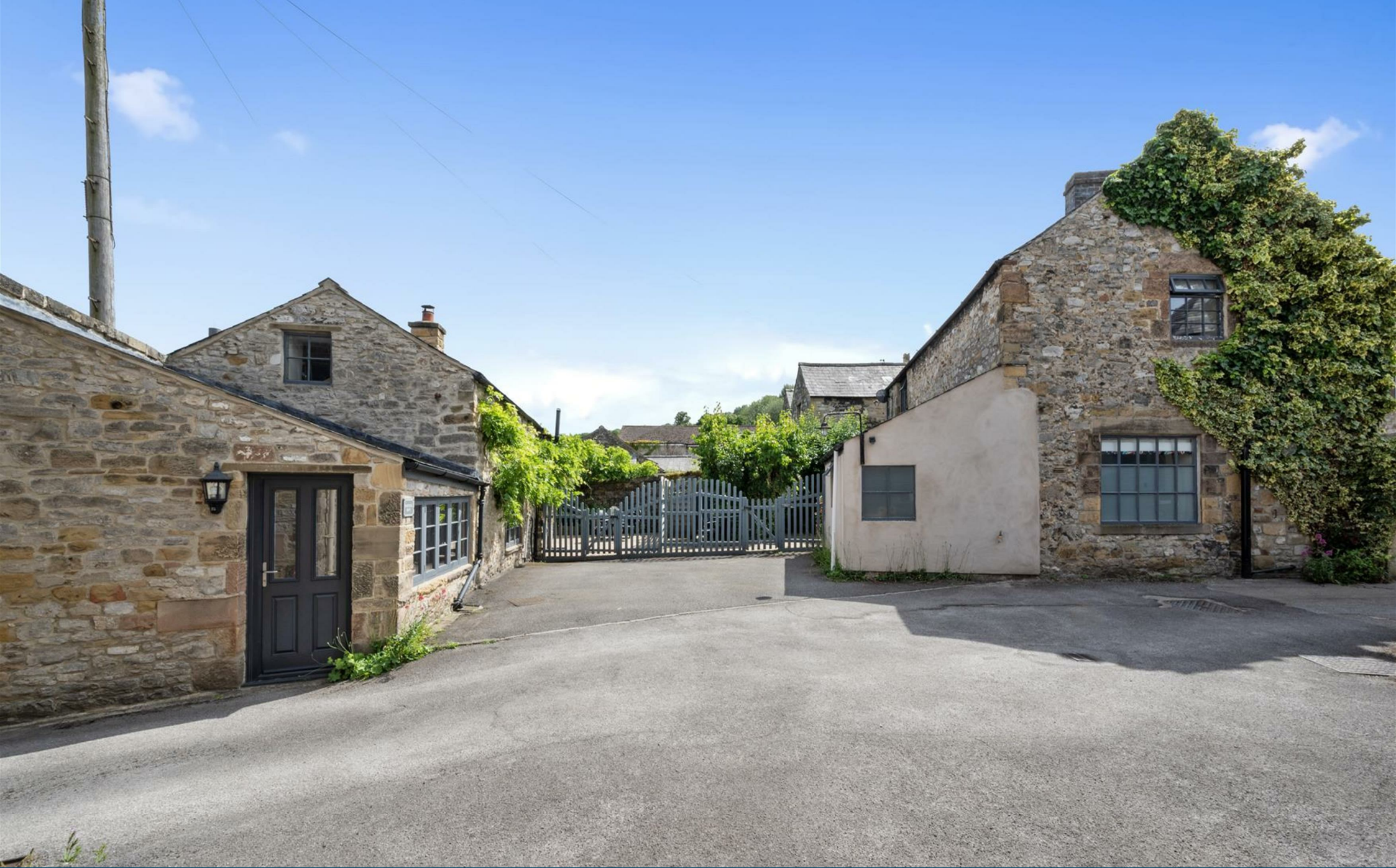
Carriage House Cottage & Bakewell Barn, Butts Road, Bakewell,