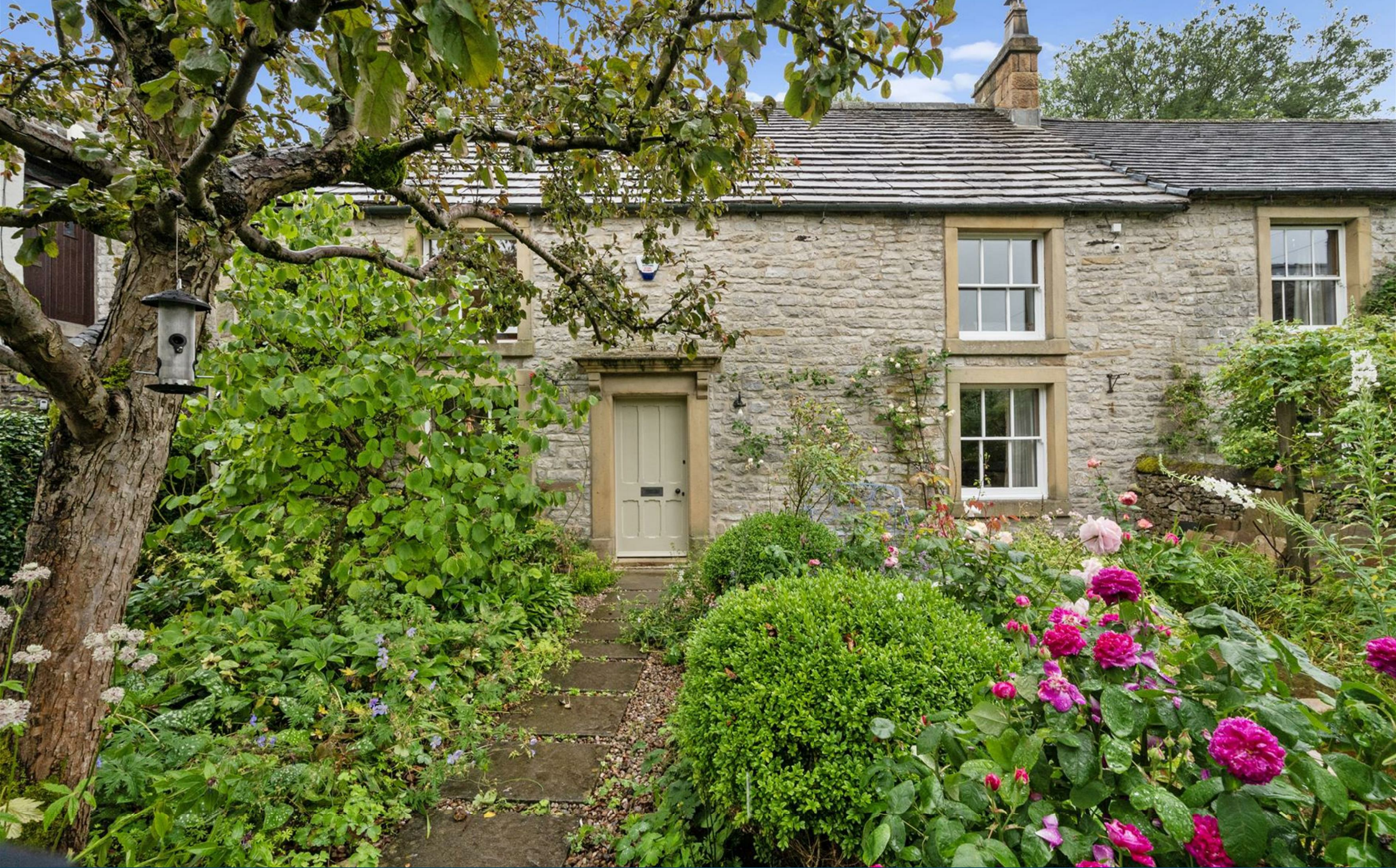
Lawson Cottage, Queen Street, Tideswell, Derbyshire, SK17 8PF