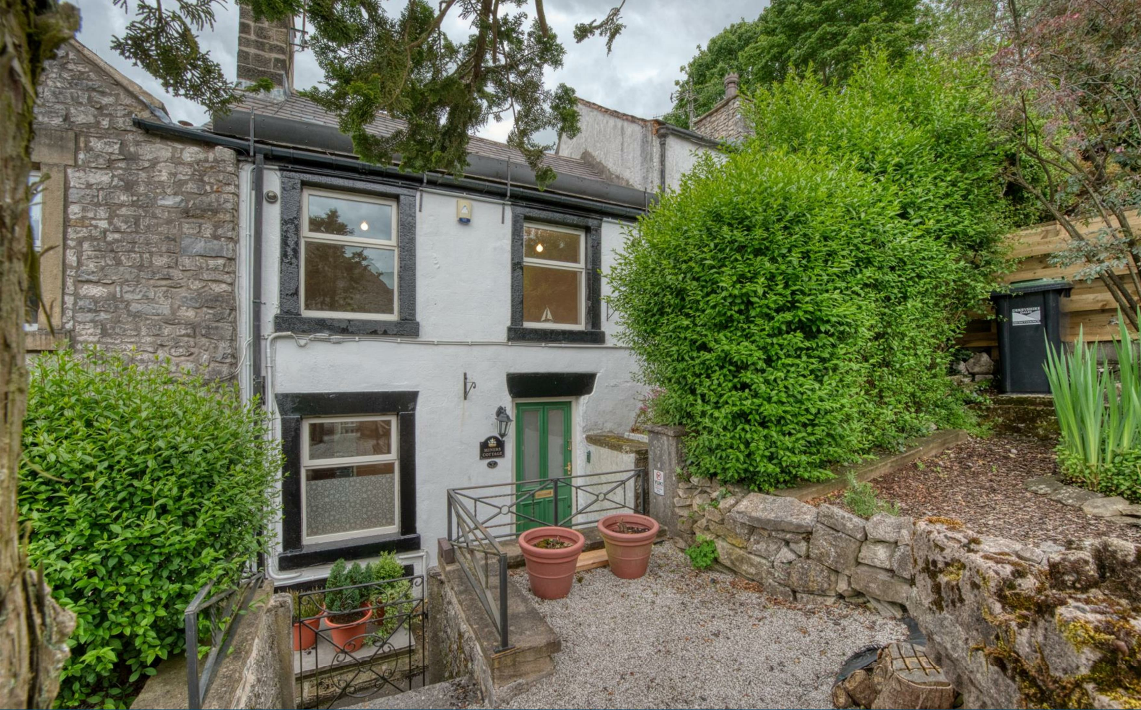
Miners Cottage Church Street, Tideswell, Derbyshire, SK17 8PE