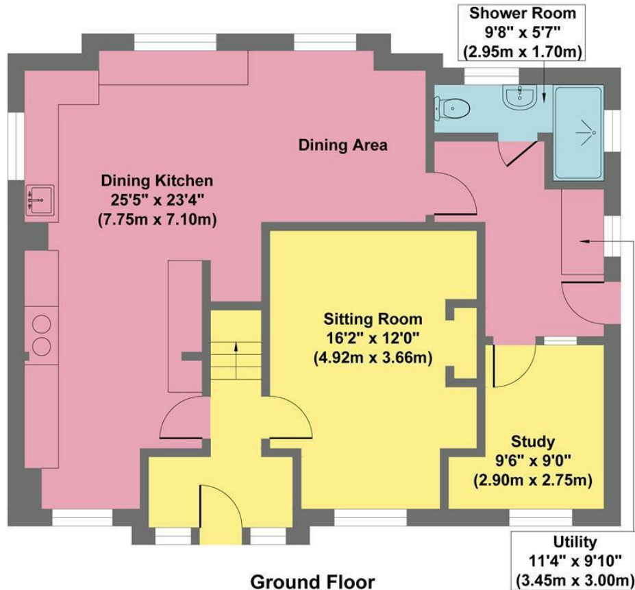
Ground Floor Approximate Floor Area 960 sq.ft (89.19 sq.m.)