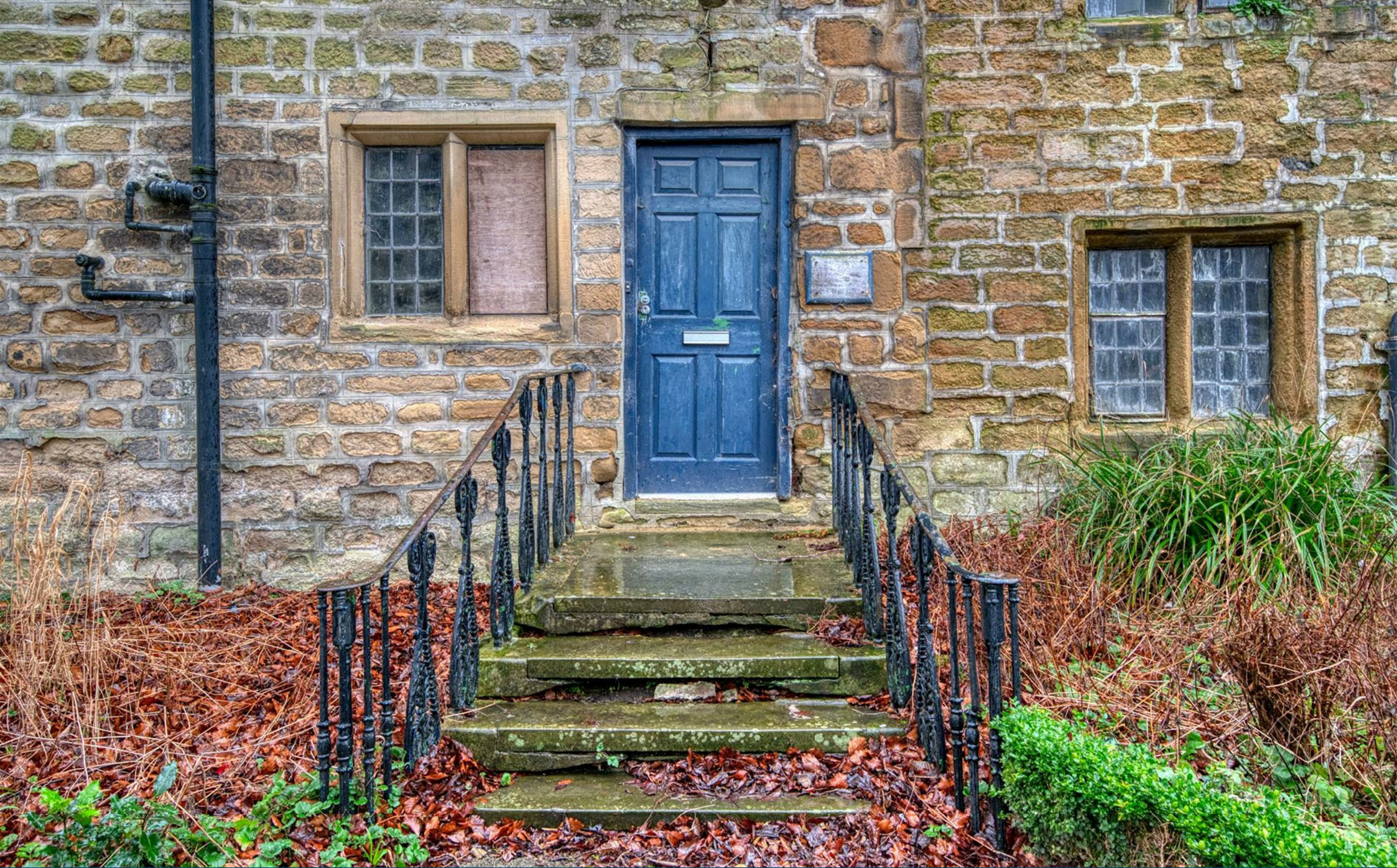
The Bath House, Bath Gardens, Bakewell, Derbyshire, DE45 1BX