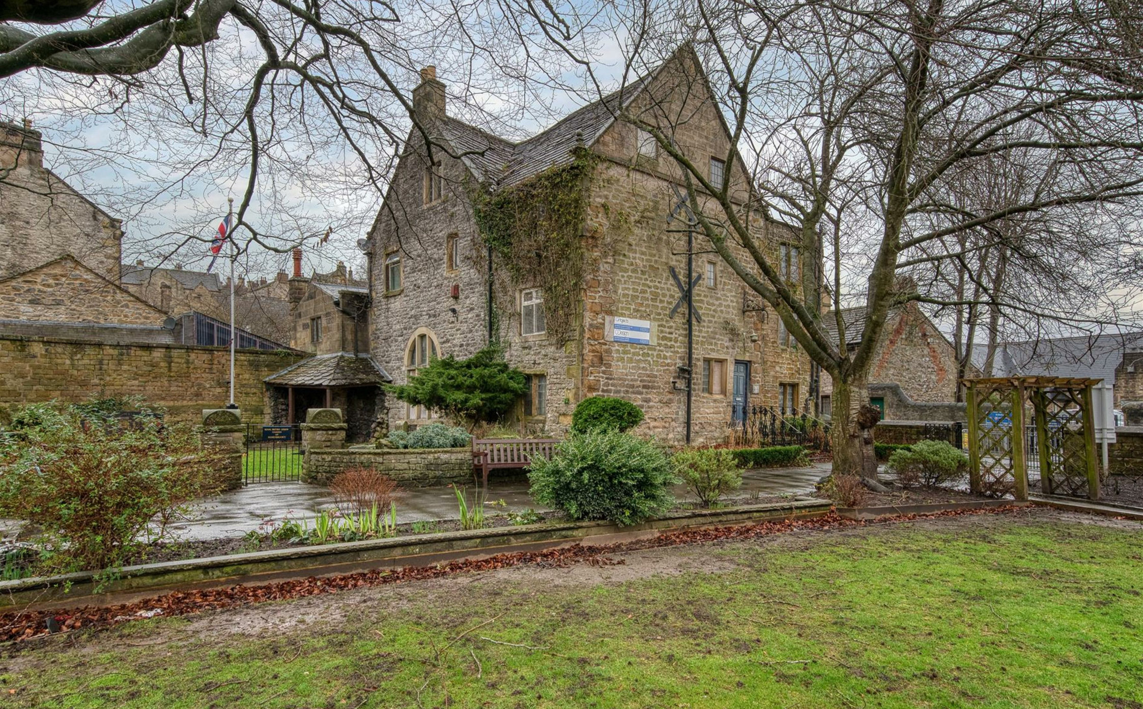
The Bath House, Bath Gardens, Bakewell, Derbyshire, DE45 1BX