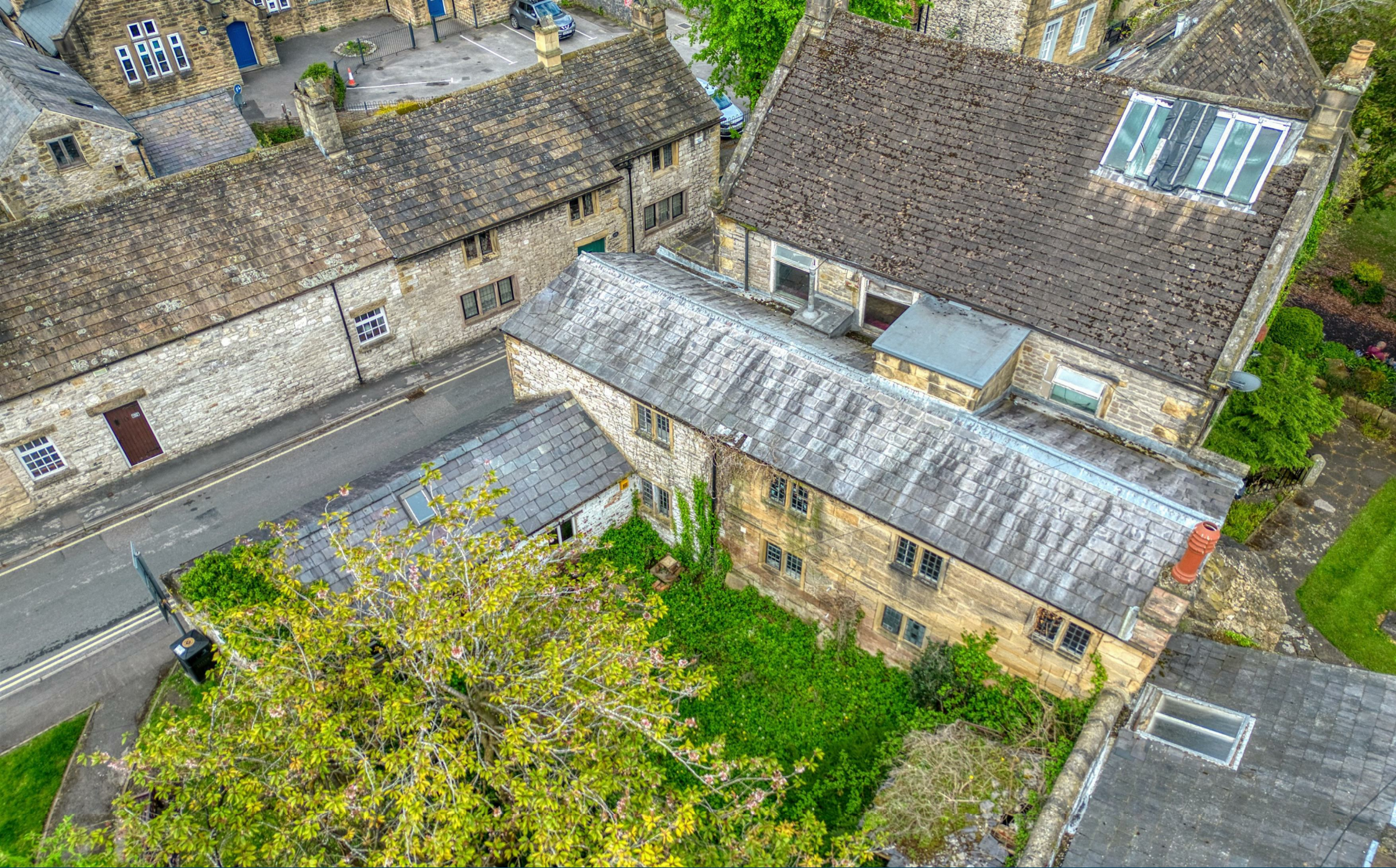
Haig House, Bath Street, Bakewell, Derbyshire, DE45 1BX