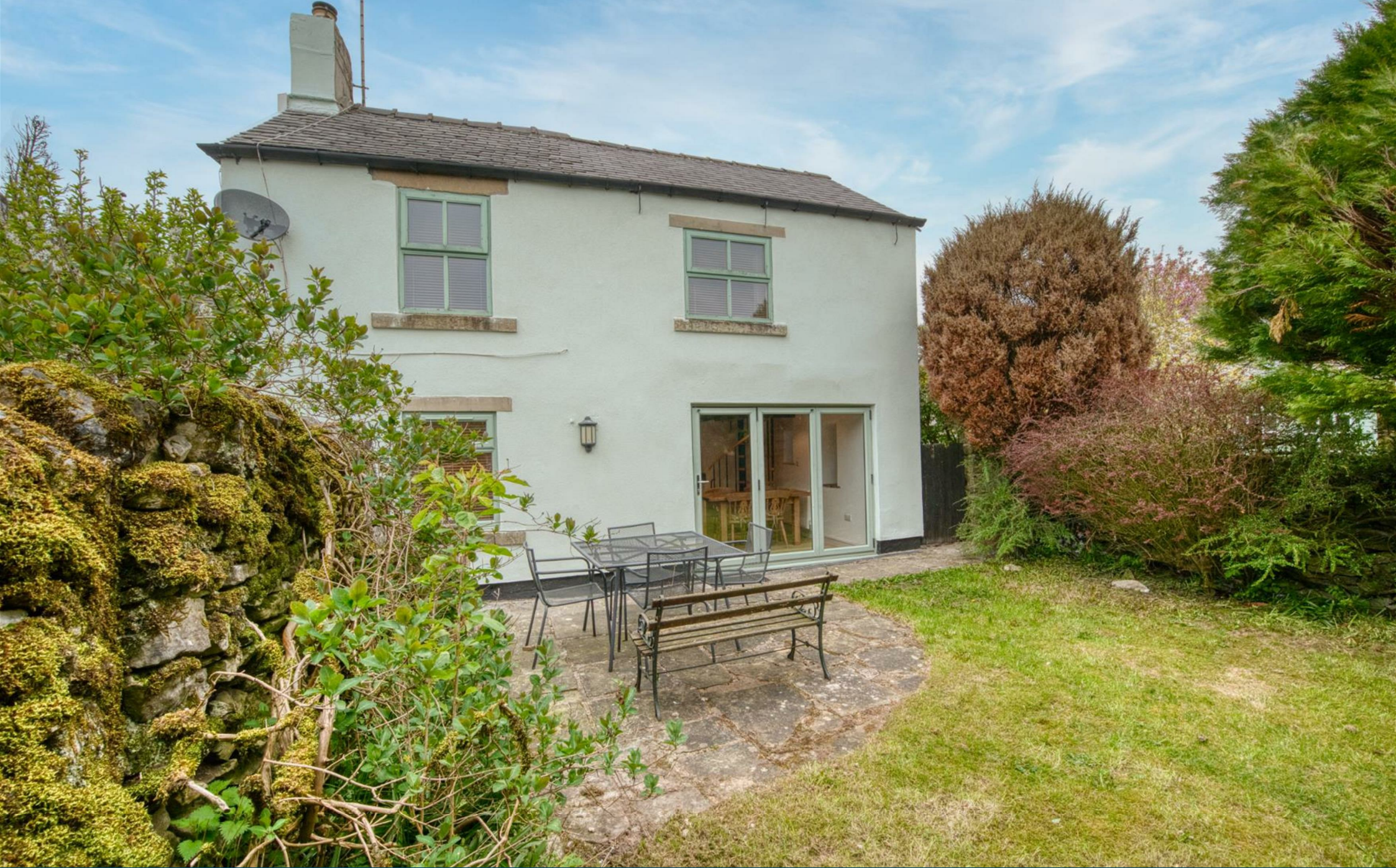
Bluebell Cottage Marrins Yard, Litton, Derbyshire, SK17 8QP