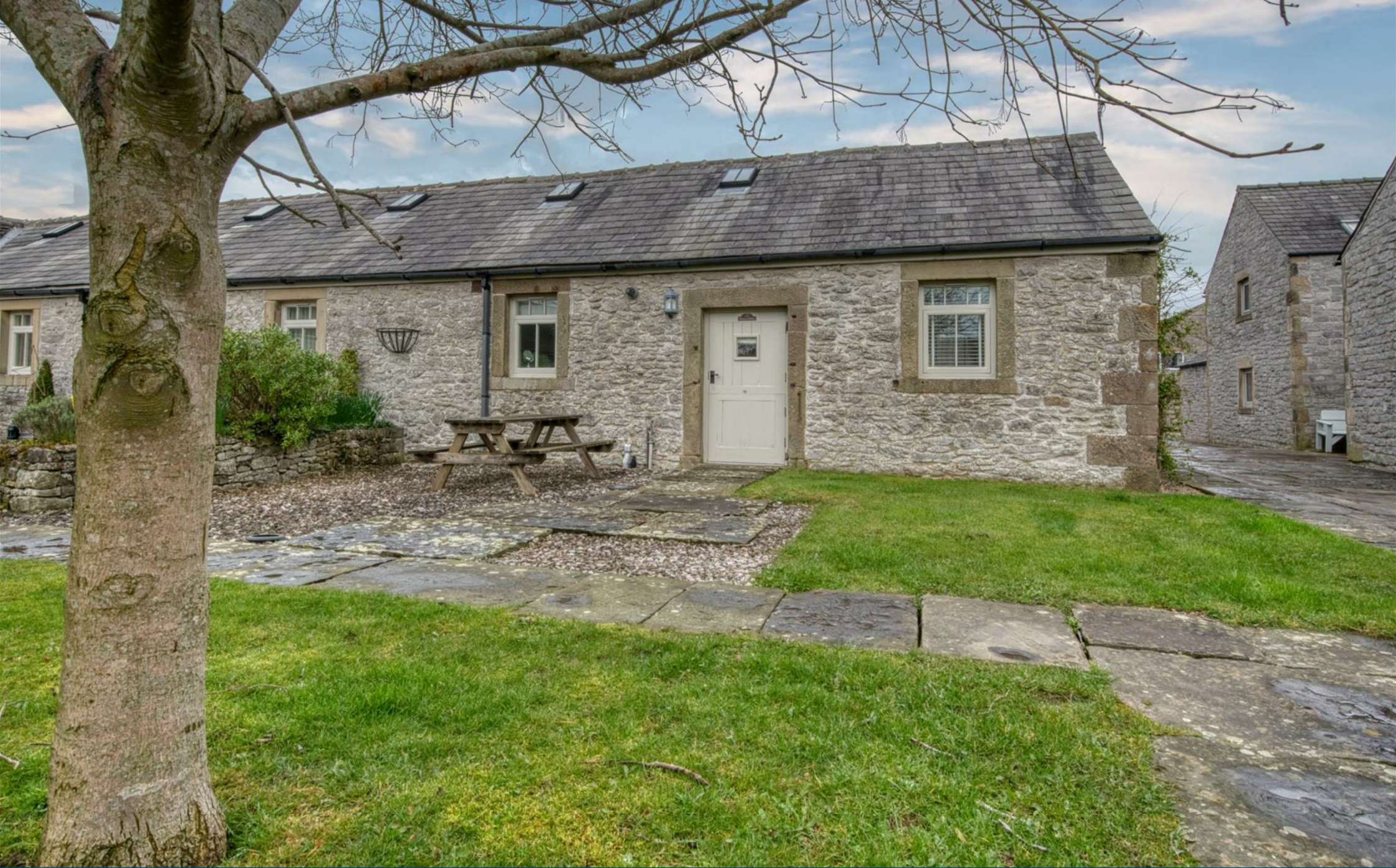
Unicorn Cottage, Manor Court, Over Haddon, Derbyshire, DE45 1JE