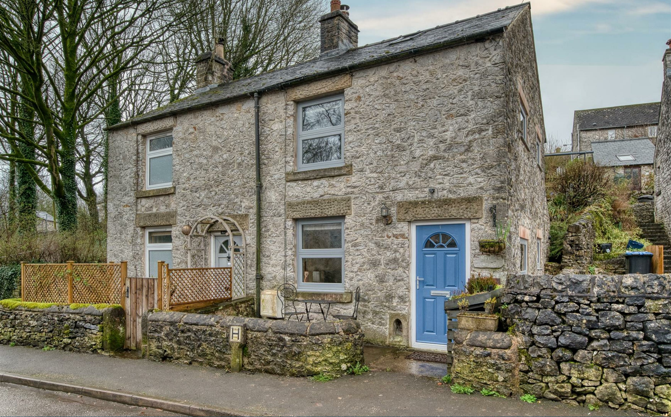
Royce Cottage, Buxton Road, Tideswell, Derbyshire, SK17 8PQ