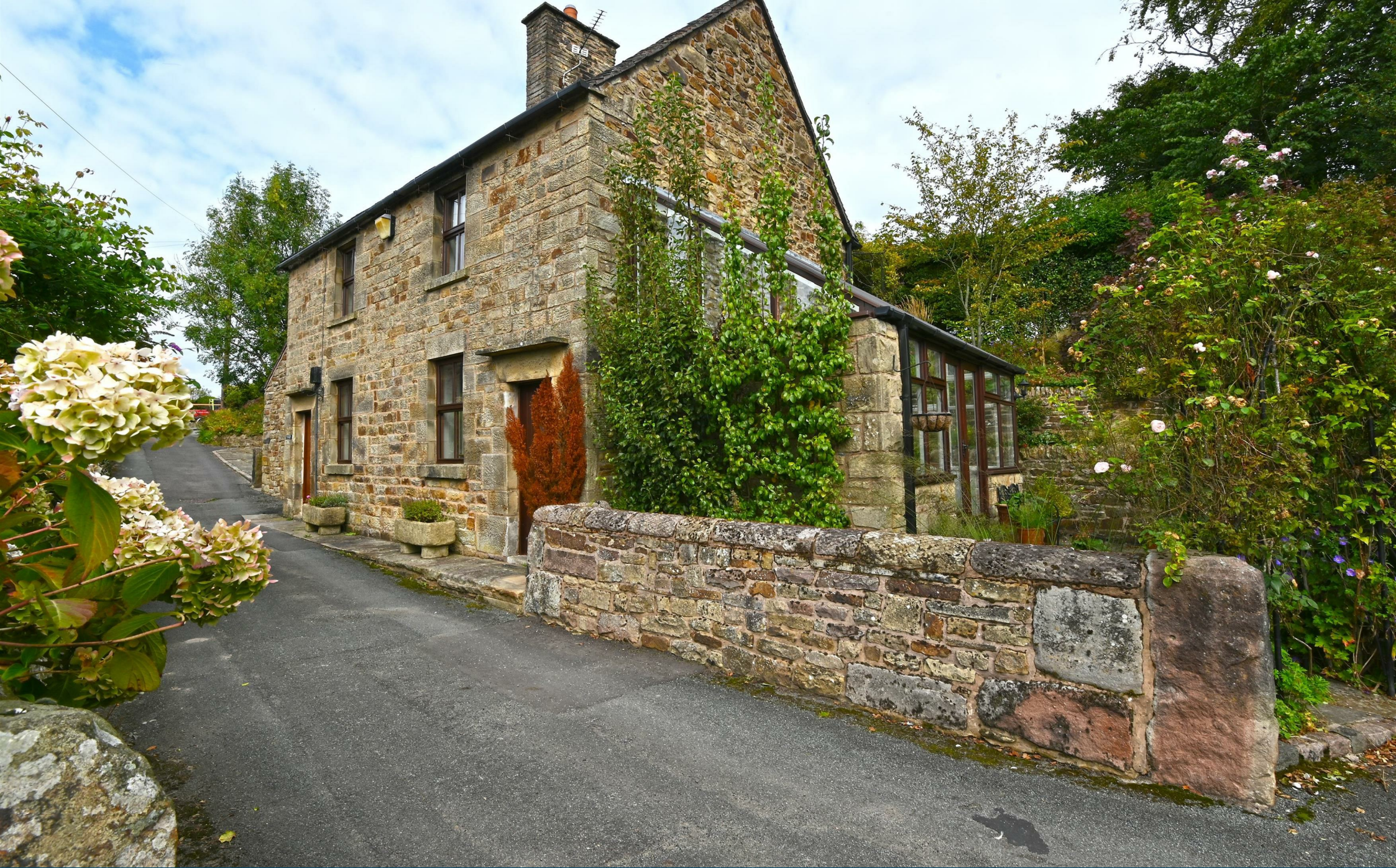
Rosannah Cottage Lane Head, Longnor, Derbyshire, SK17 0PD