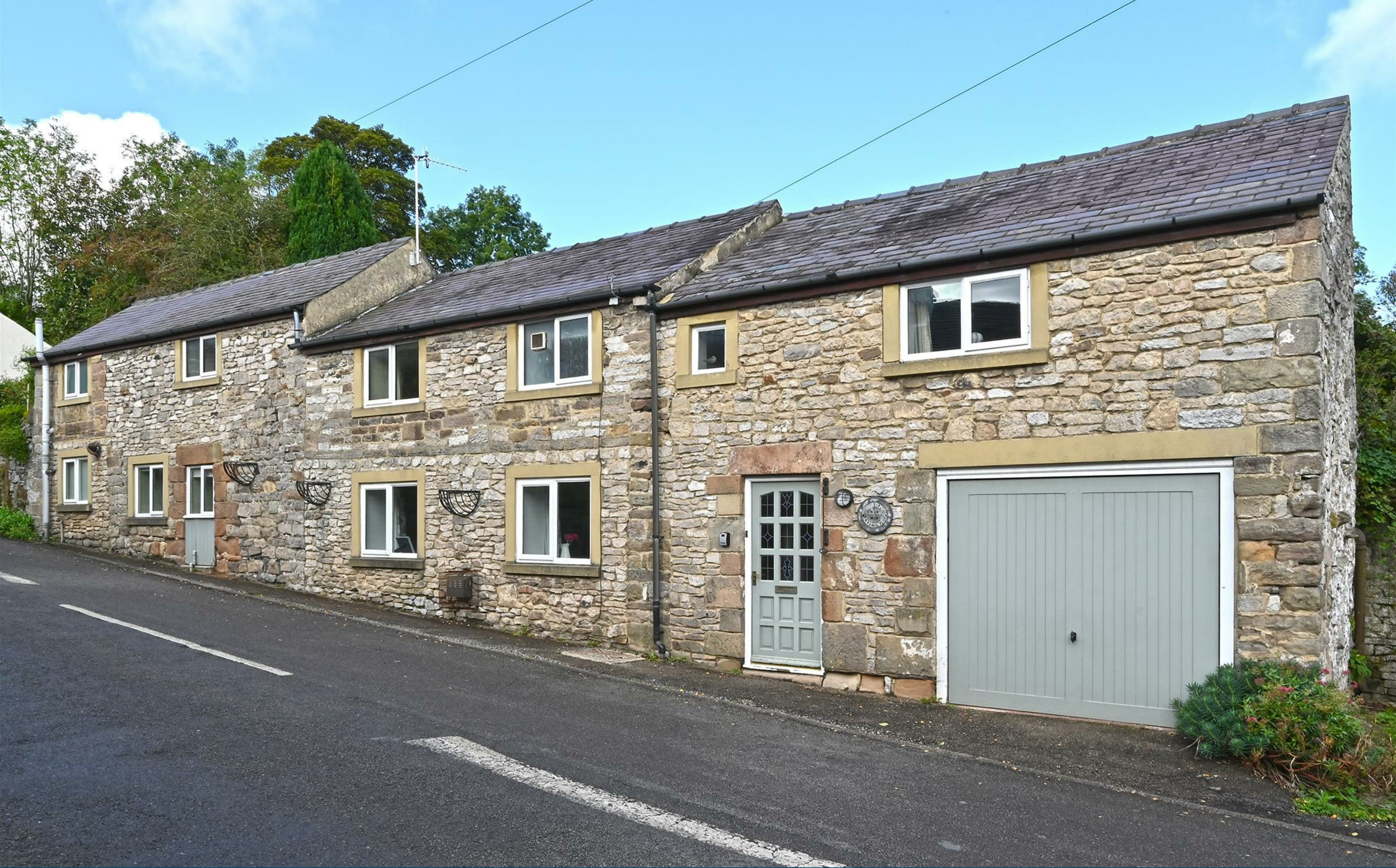
Button Cottage, Main Road, Wensley, Derbyshire, DE4 2LH