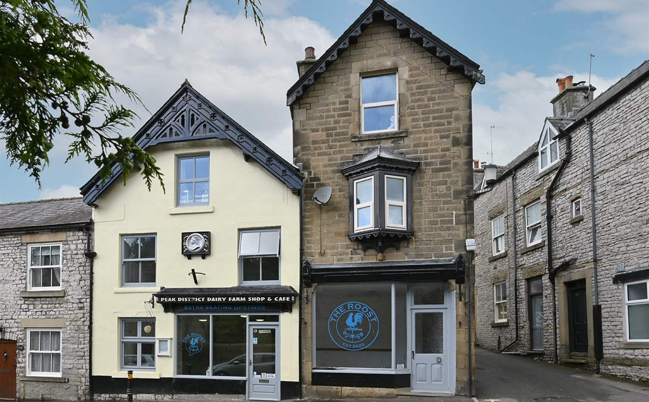
Chapman House, Queen Street, Tideswell, Derbyshire, SK17 8JT