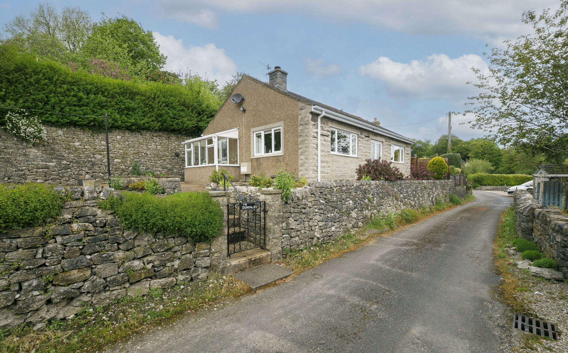
The Bungalow, Undercliffe, Bakewell, Derbyshire, DE45 1DH