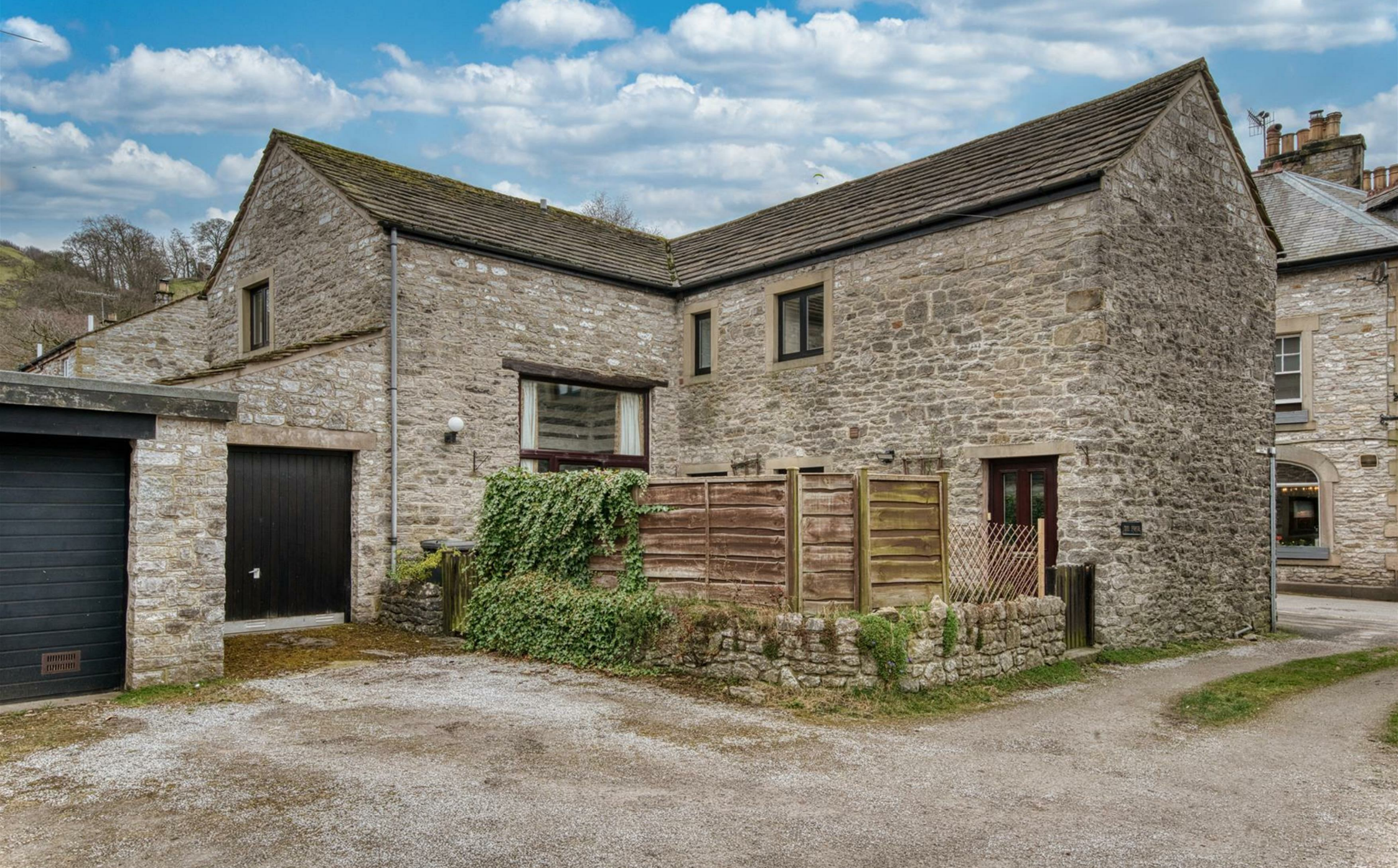
The Forge, Burrows Fold, Castleton, Derbyshire, S33 8WF