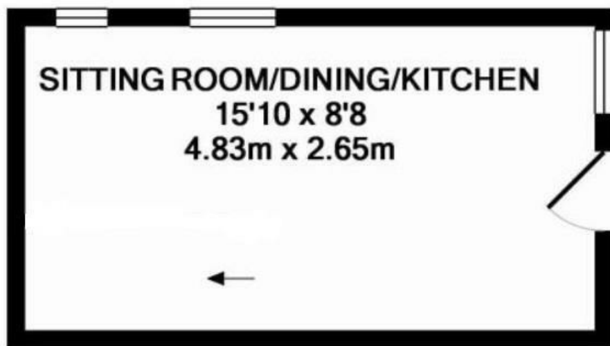
GROUND FLOOR APPROX. FLOOR AREA 138 SQ.FT. (12.8 SQ.M.)