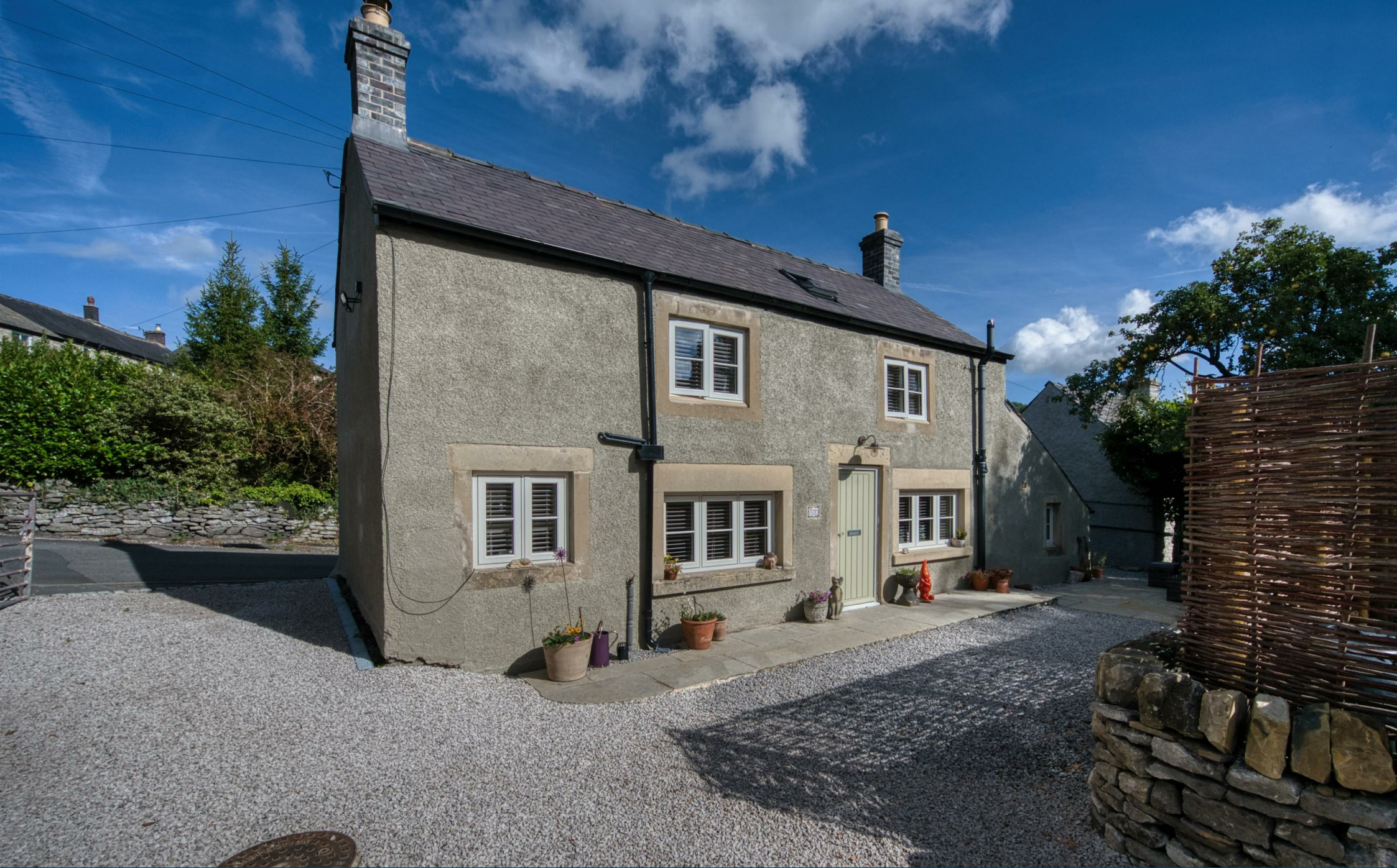
Laneside Cottage, High Street, Calver, Derbyshire, S32 3XP