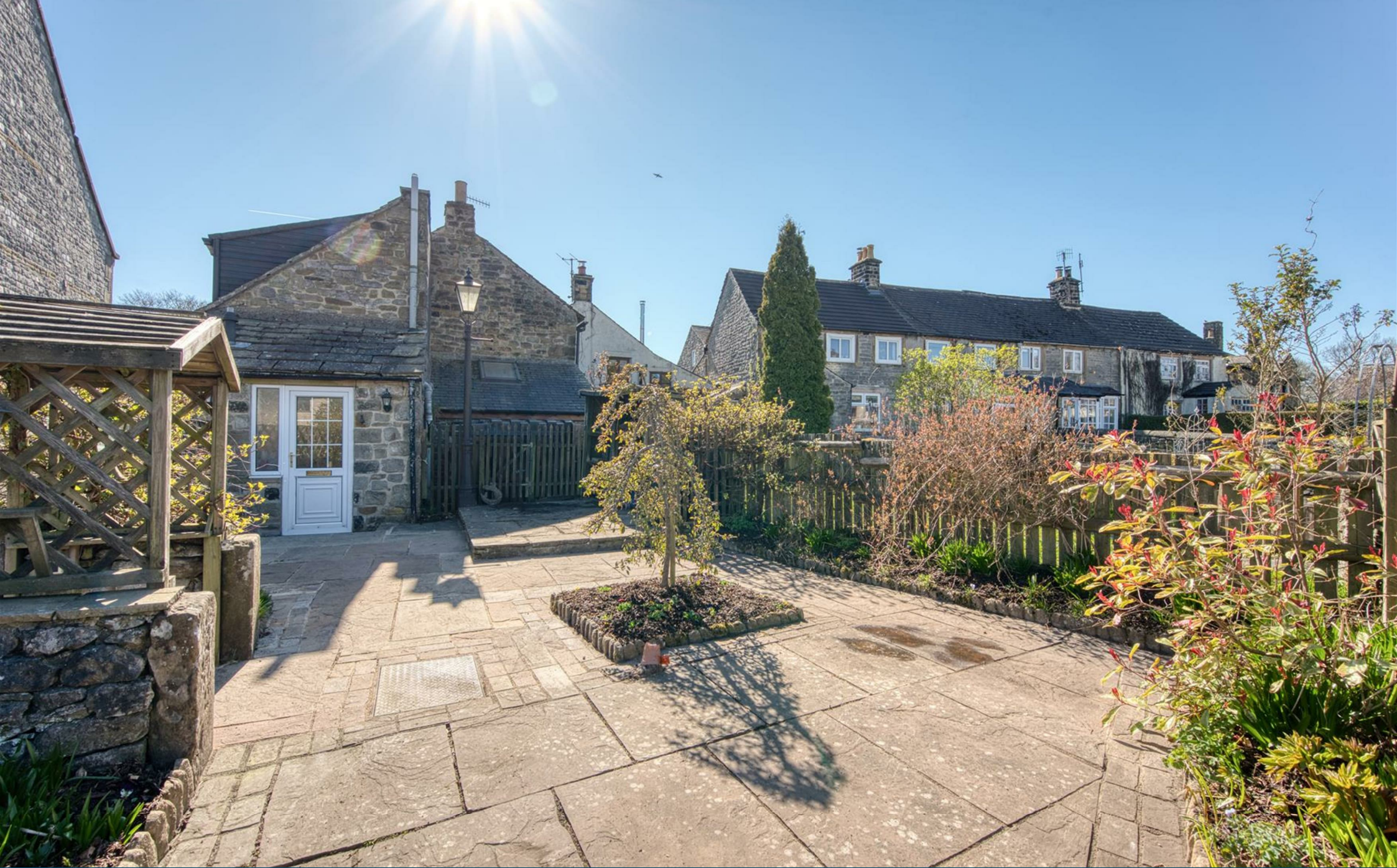
Rose Cottage, Great Hucklow, Derbyshire, SK17 8RF