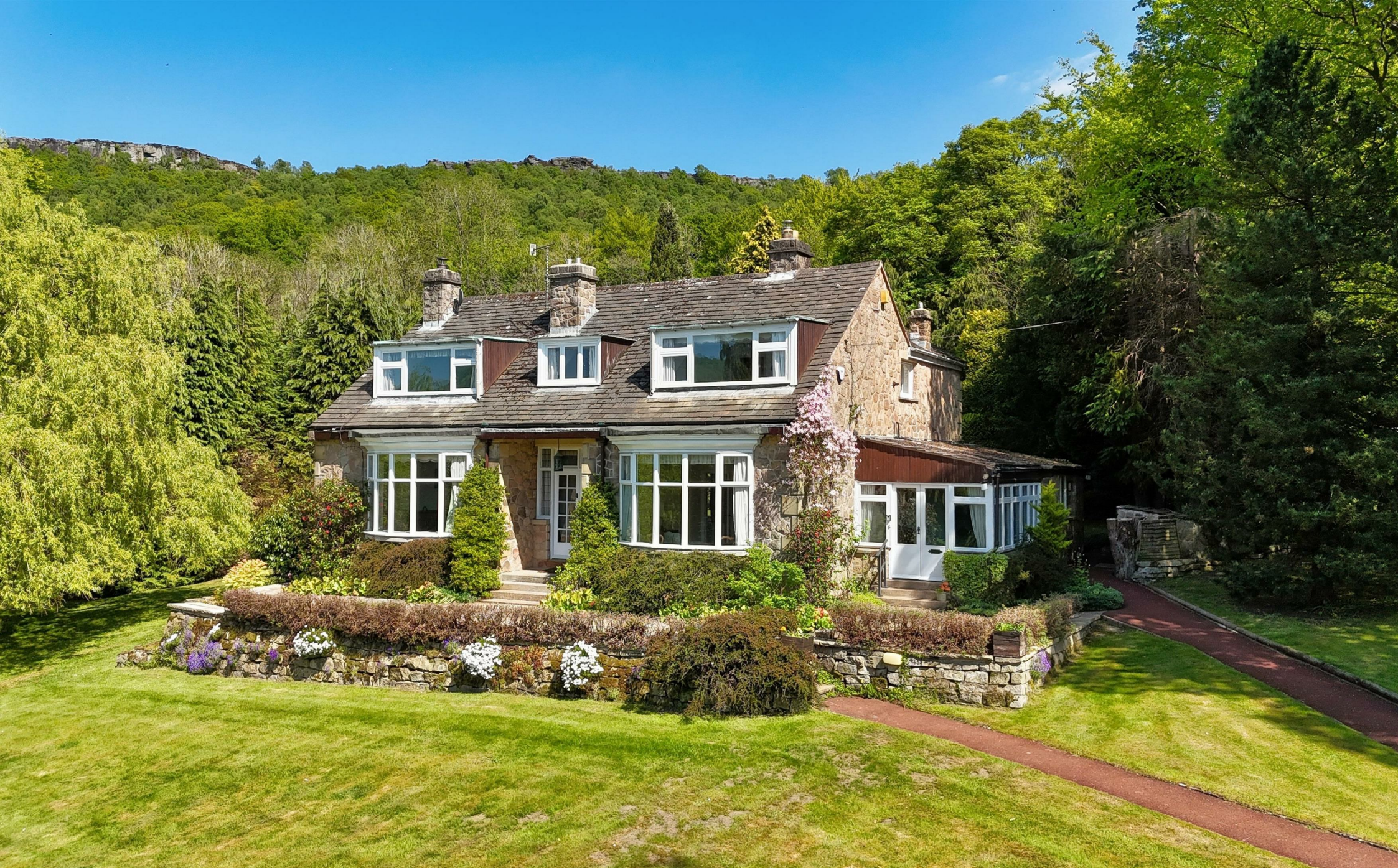
Woodcliffe Cottage Froggatt Edge, Froggatt, Derbyshire, S32 3ZB