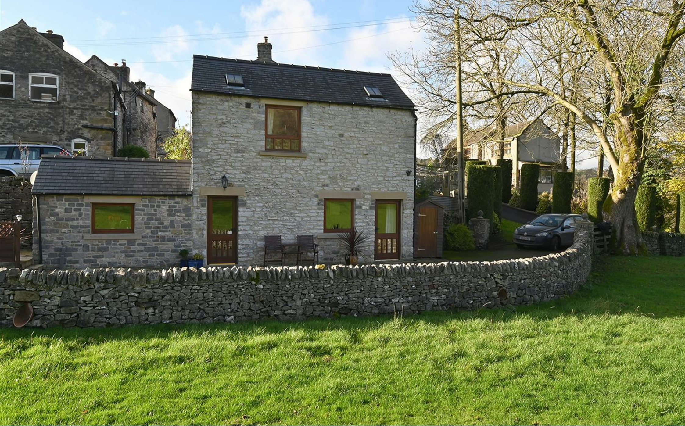
Woodcroft Barn, The Hills, Bradwell, Derbyshire, S33 9HZ