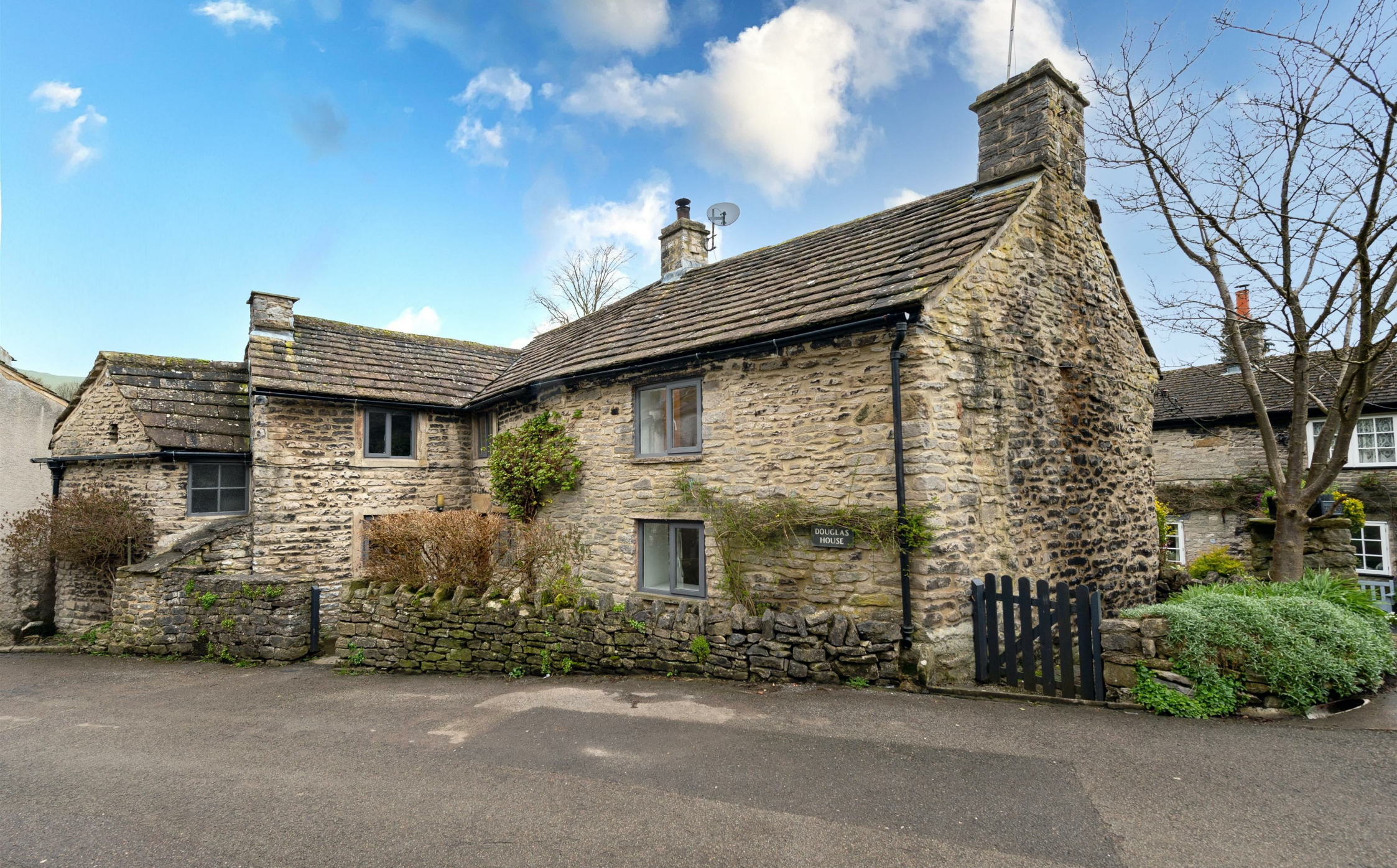
Douglas House The Stones, Castleton, Derbyshire, S33 8WX