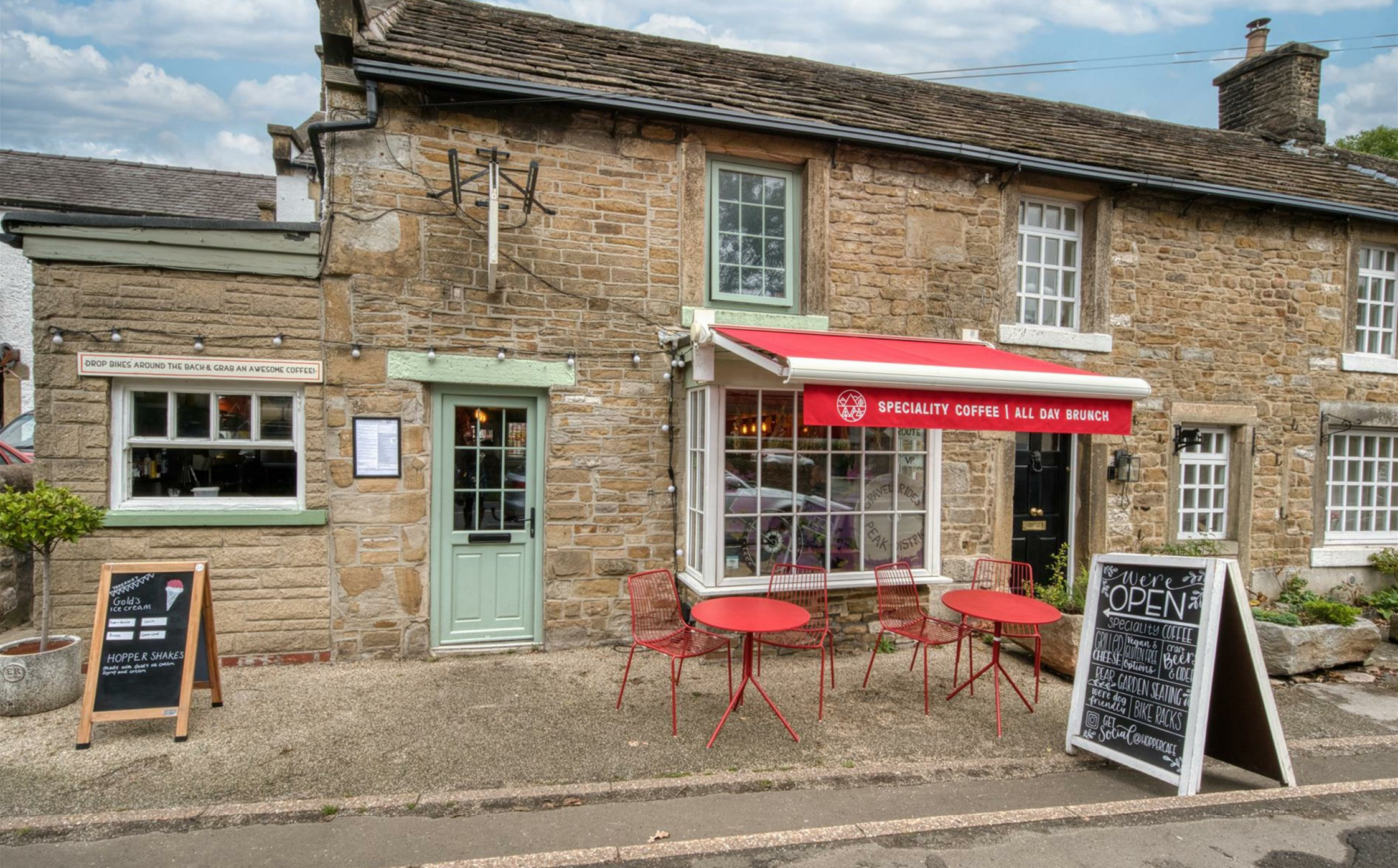
Grasshopper Cafe & Apartment, 18 Castleton Road, Hope, Derbyshire, S33