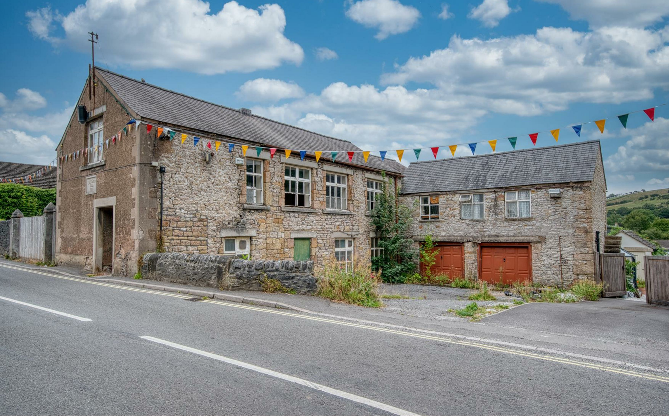
Newburgh Hall, Netherside, Bradwell, Derbyshire, S33 9JL