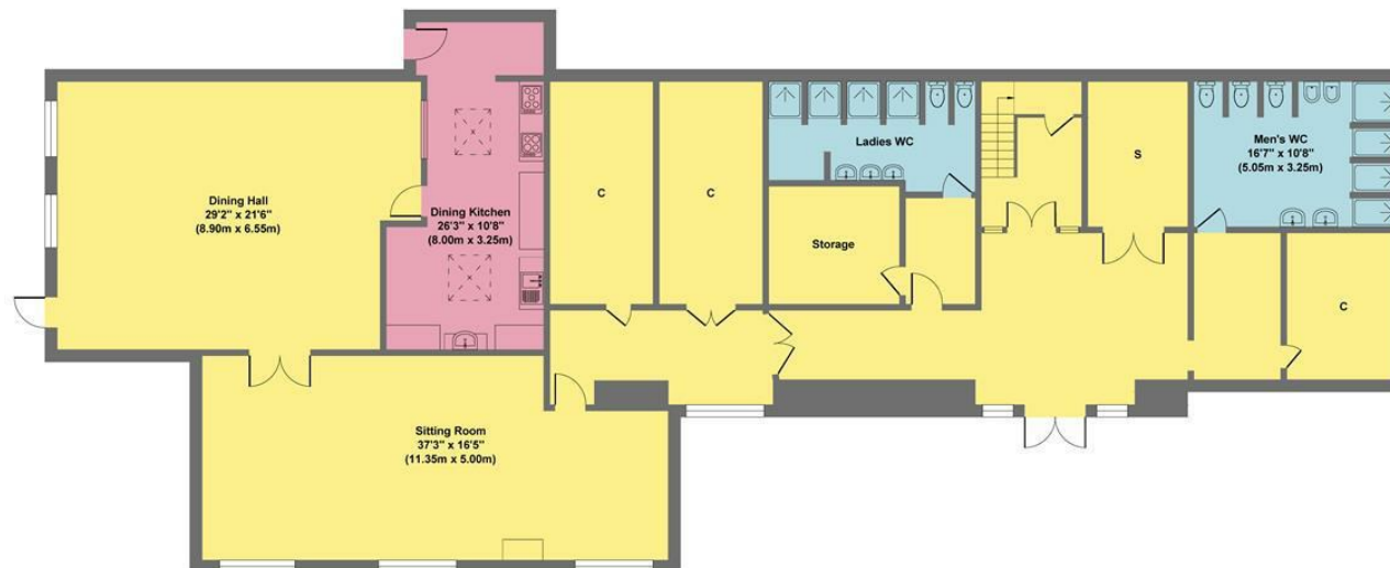
Ground Floor Approximate Floor Area 3181 sq.ft (295.55 sq.m.)

Approx. Gross Internal Floor Area 4950 sq.ft / 459.87 sq.m