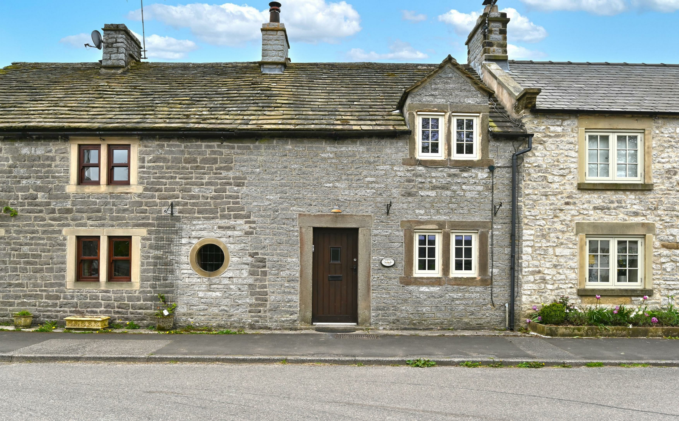
Dormy Cottage Foolow, Derbyshire, S32 5QR