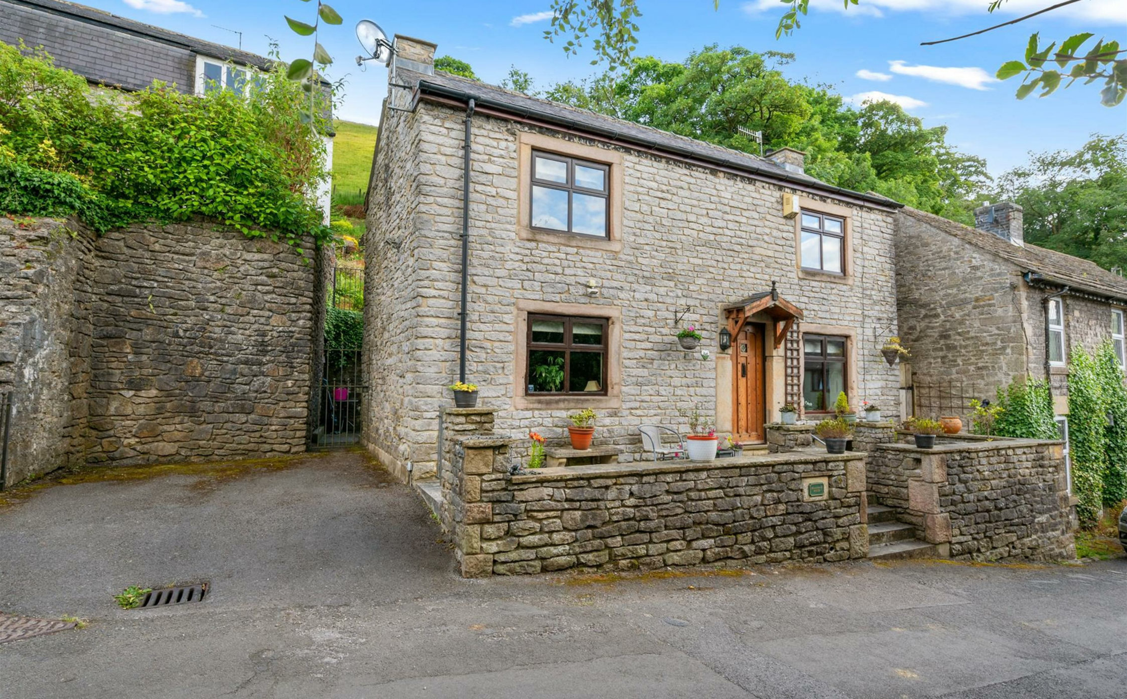
Bradshaw House Pindale Road, Castleton, Hope Valley, S33 8WU