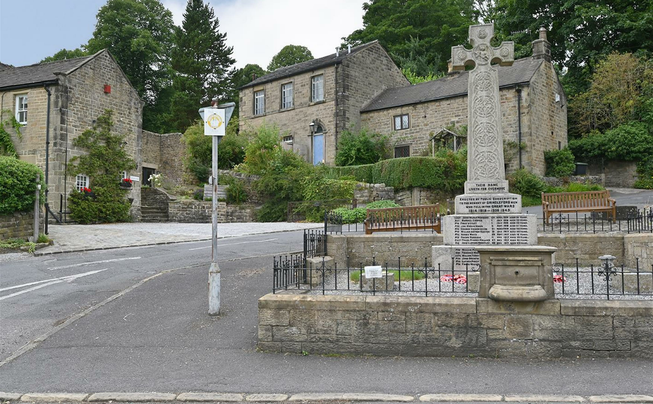
The Former Youth Club, Sir William Hill Road, Grindleford, S32 2HS