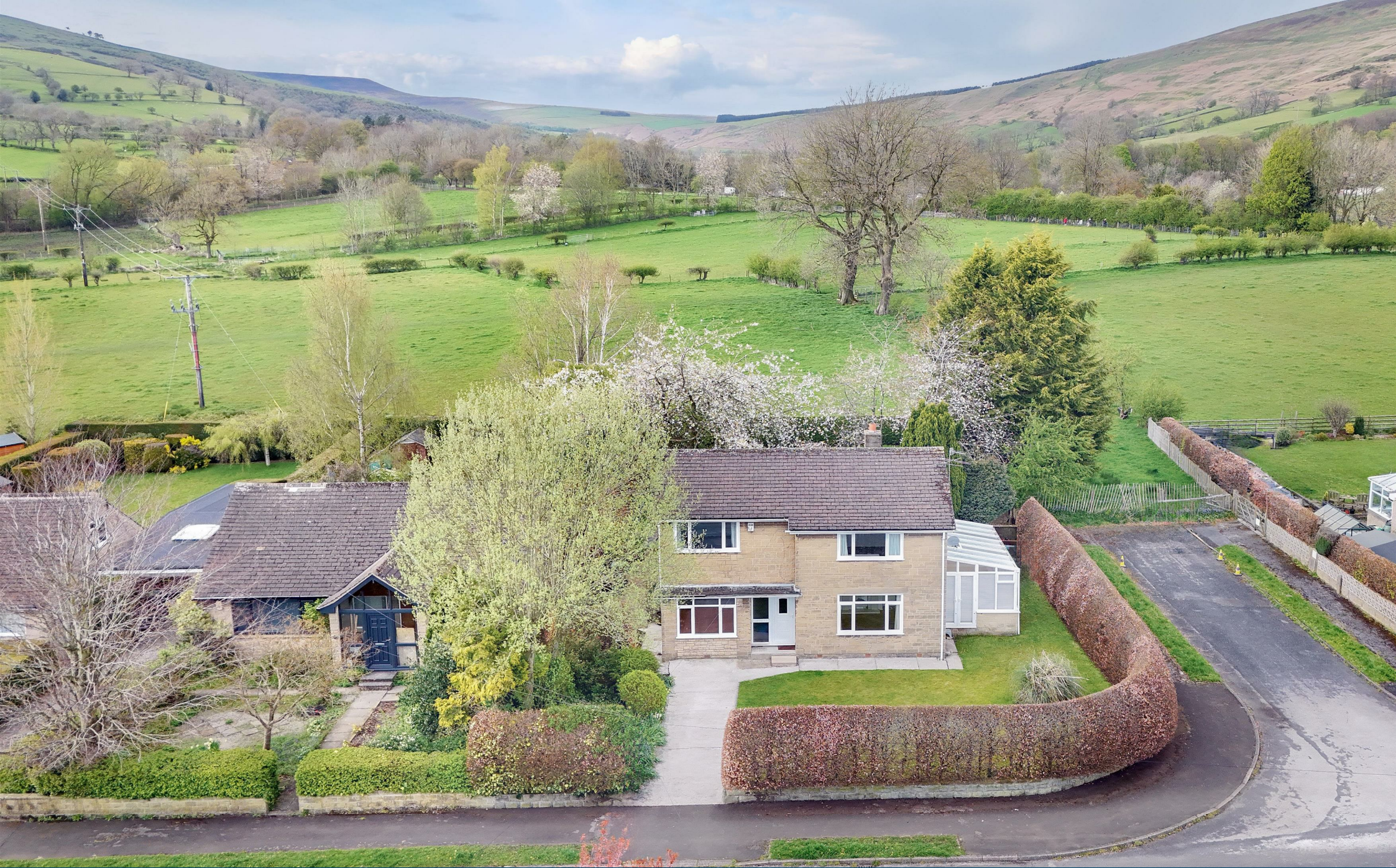
61 Eccles Close, Hope, Derbyshire, S33 6RG