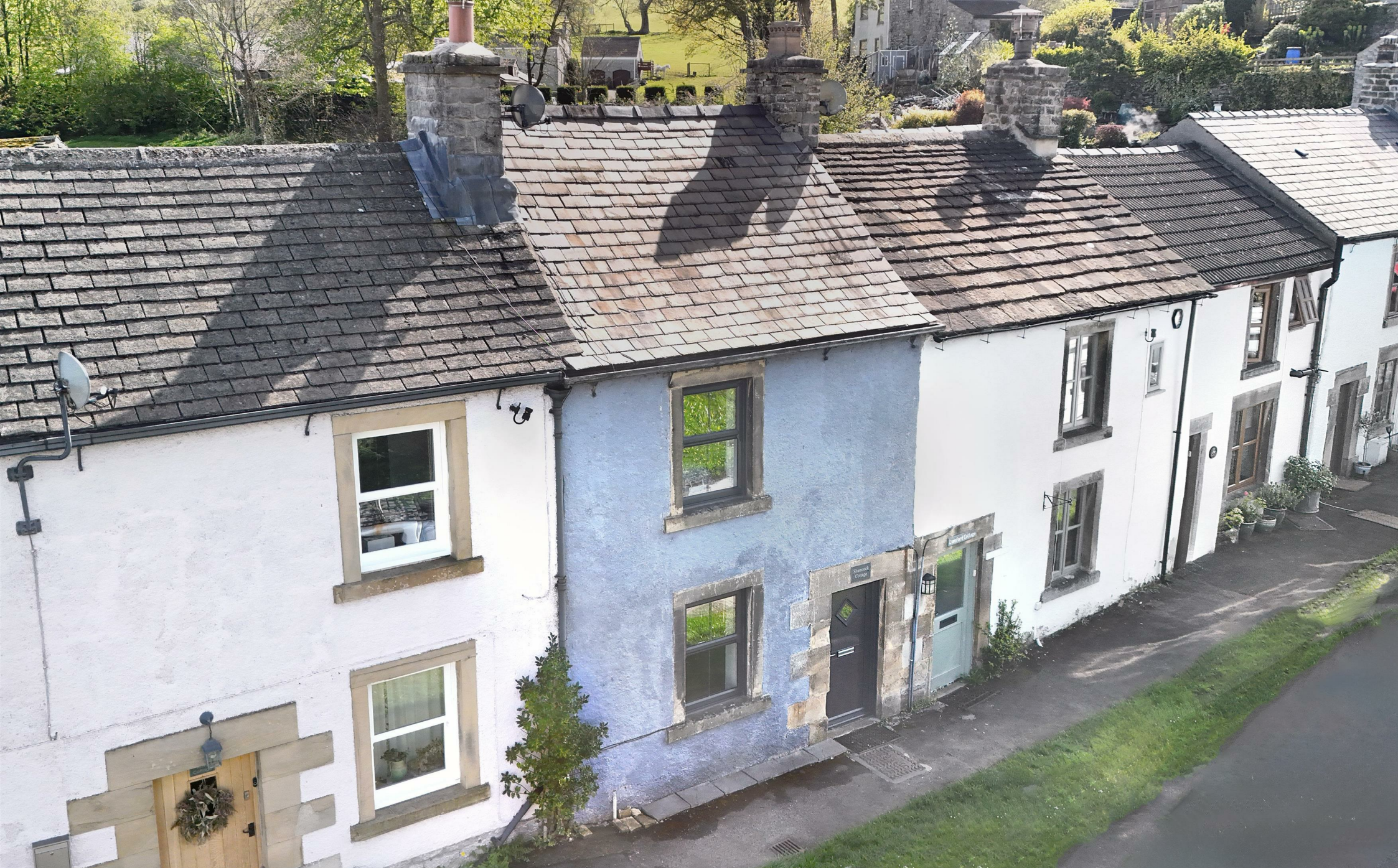
Shamrock Cottage, Church Street, Bradwell, Derbyshire, S33 9HJ