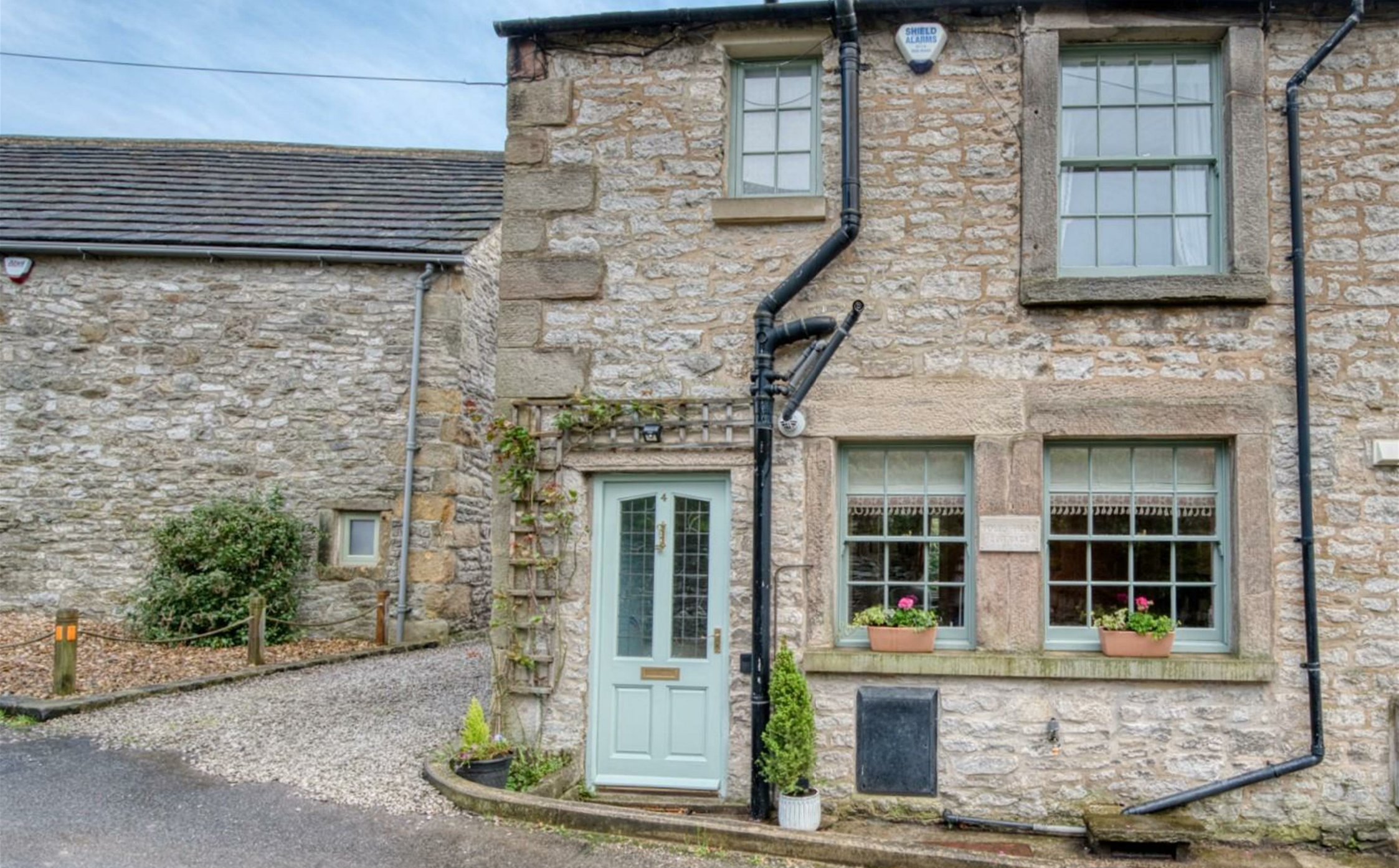
4 Folds Head Cottage, Calver, Derbyshire, S32 3XJ