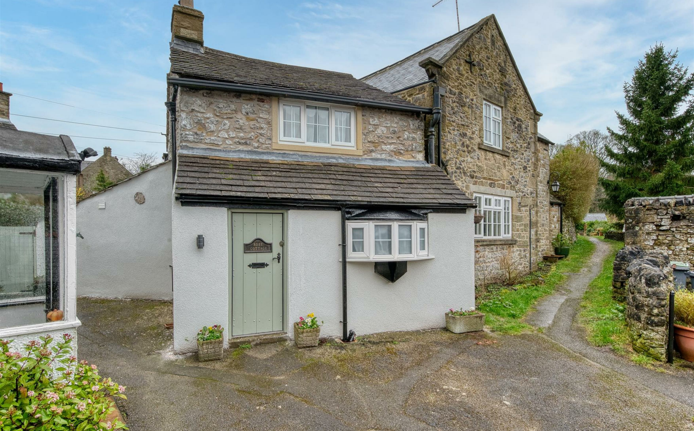
Rose Cottage, Lydgate, Eyam, Hope Valley, S32 5QU