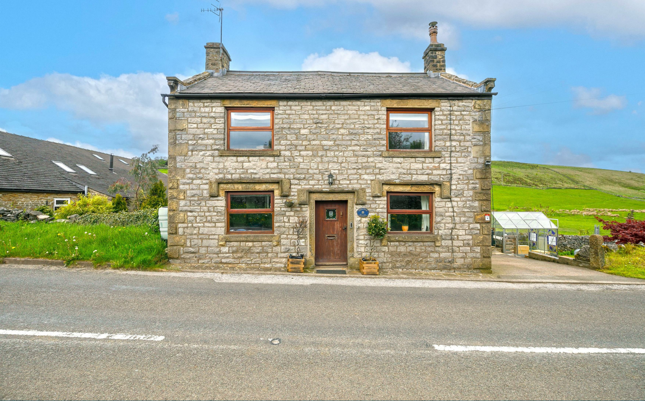
Toll Bar House Sparrow Pit, Derbyshire, SK17 8ET