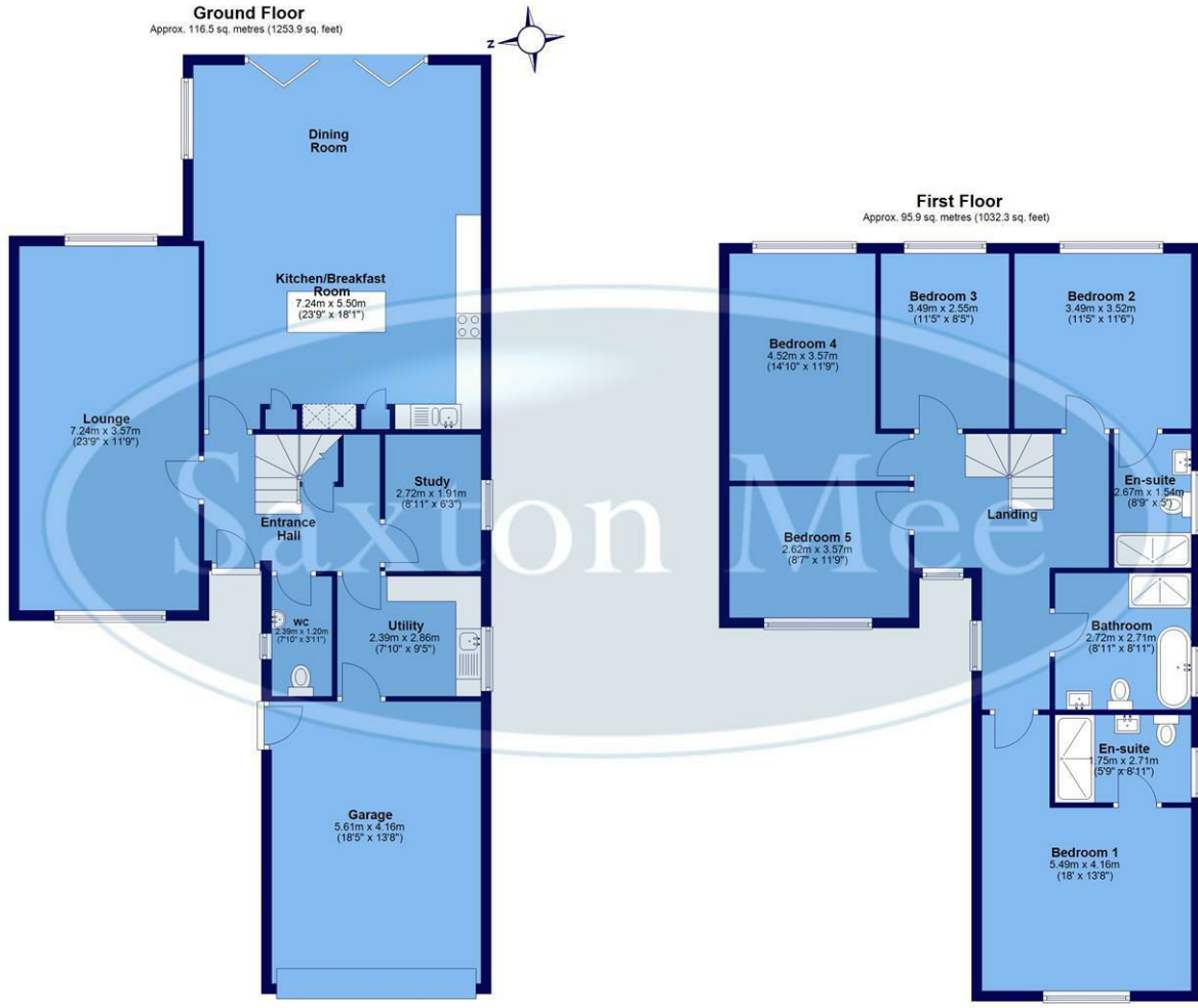
Total area: approx. 212.4 sq. metres (2286.2 sq. feet) All measurements are approximate and to max vertical and horizontal lengths Plan produced using Planity.