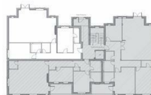
GROUND FLOOR | Location Plan